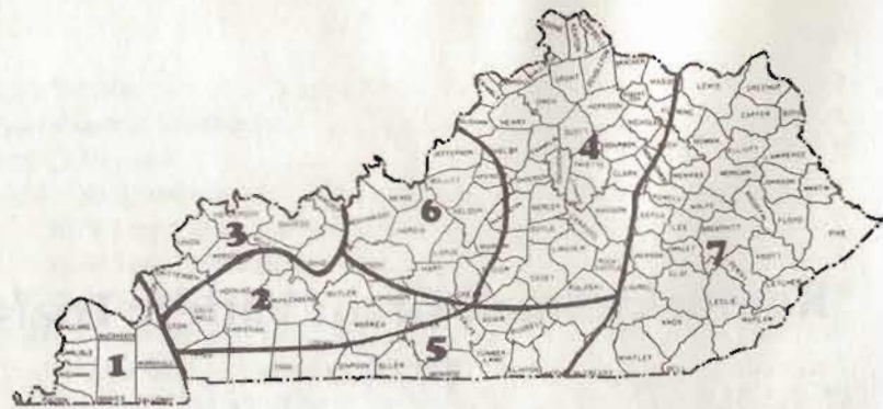
Figure 1.—Agro-climatic regions of Kentucky small grain variety trials.