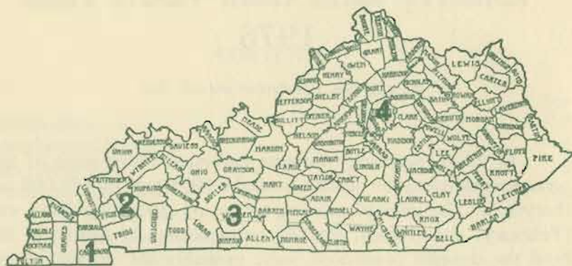
Fig. 1.—Testing locations of Kentucky small grain variety trials.