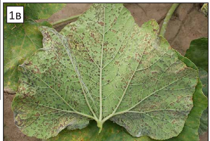
FIGURE 1. SYMPTOMS OF CUCURBIT DOWNY MILDEW BEGIN AS PALE TO BRIGHT-COLORED YELLOW SPOTS THAT BECOME IRREGULAR AND BLOCKY (A). SPOTS SPREAD THROUGHOUT THE PLANT AND DEVELOP INTO NECROTIC LESIONS (B).