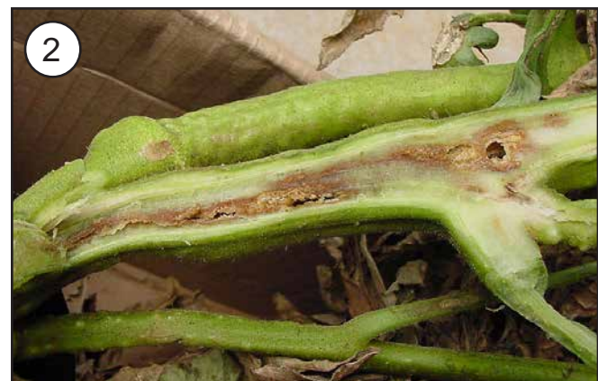
FIGURE 2. STEM CANKER AND PITH NECROSIS DEVELOP AS A RESULT OF BACTERIAL CANKER.