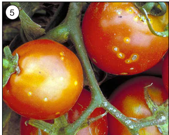
FIGURE 3. MARGINAL NECROSIS OF OLDER LEAVES (OFTEN CALLED “FIRING”) OCCURS AS A CONSEQUENCE OF FOLIAR INFECTIONS. FIGURE 4. CLOSE-UP OF A TOMATO LEAF SHOWING “FIRING” SYMPTOMS. FIGURE 5. SECONDARY INFECTIONS FROM RAIN-SPLASHED BACTERIA CAUSE BLISTER-LIKE LESIONS. FIGURE 6. INFECTED FRUIT DEVELOP “BIRDS-EYE” SPOTS THAT REDUCE FRUIT QUALITY.

As symptoms progress, marginal browning or necrosis (also called “firing”) becomes evident on older leaves (FIGURES 3 & 4). Firing occurs when the pathogen is present on leaf surfaces, causing foliar infections. Brown (necrotic) leaf tissues may have a yellow border, and affected leaves tend to curl upward. Secondary foliar infections from rain-splashed bacteria develop circular, somewhat raised lesions with brown centers and white-tan margins (FIGURE 5).