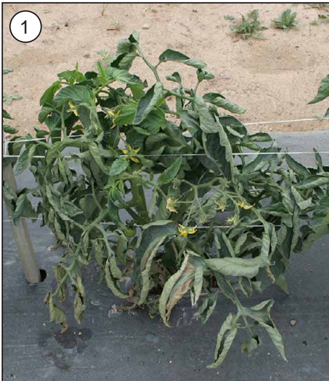
FIGURE 1. WILTING IS OFTEN THE FIRST INDICATION THAT TOMATO PLANTS ARE AFFECTED BY BACTERIAL CANKER.

Wilting is often the first symptom observed on mature plants (FIGURE 1), although this symptom can occur with other diseases and abiotic issues. Later, infected stems split, resulting in open cankers that give this disease its name. When cut lengthwise, the vascular system of diseased stems has a reddish-brown discoloration. Stem centers (pith) may be discolored and grainy or pitted (FIGURE 2).