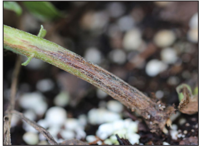
FIGURE 8. RHIZOCTONIA STEM ROT CAUSES REDDISH BROWN CANKERS TO DEVELOP ON LOWER STEMS.