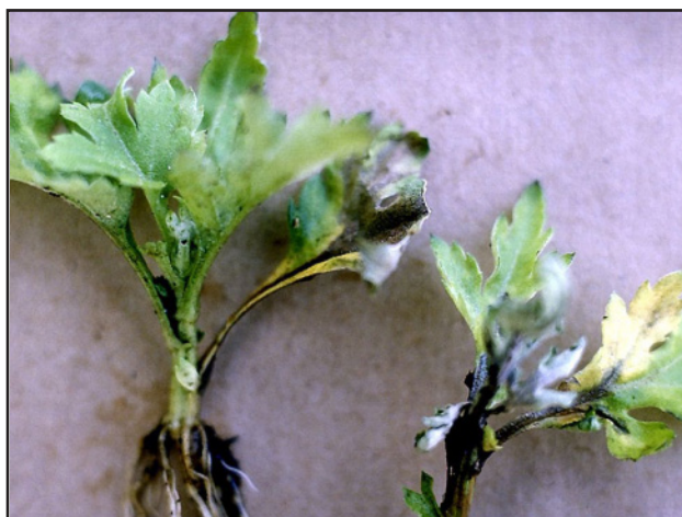
FIGURE 1. BROWN TO BLACK STEM DECAY IS A COMMON SYMPTOM OF BACTERIAL BLIGHT; OFTEN PLANT DEATH RESULTS.