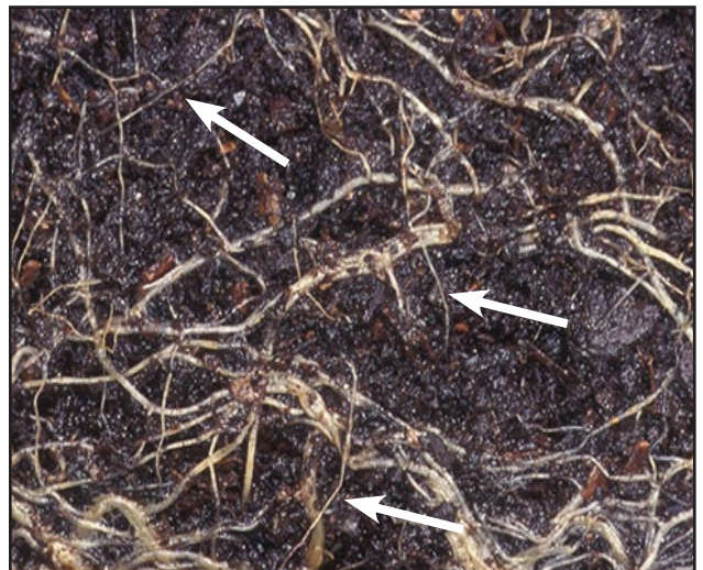
FIGURE 7. PYTHIUM ROOT ROT RESULTS IN DECAYING ROOTS; ROOT CORTX MAY SLOUGH OFF (EXAMPLES AT ARROWS).