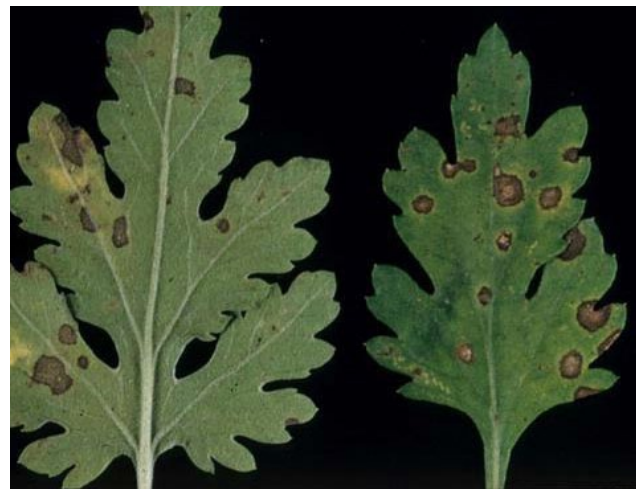
FIGURE 4. FUNGAL LEAF SPOTS ARE OFTEN BROWN TO BLACK WITH LIGHTER CENTERS. THIS PHOTO SHOWS SEPTORIA LEAF SPOT.