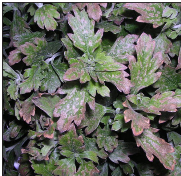
FIGURE 11. HIGH SOLUBLE SALTS ACCUMULATE AT LEAF MARGINS AND LEAF TIPS, CAUSING THEM TO TURN BROWN.

Interveneal chlorosis of young leaves is the first indication of iron deficiency. When severe, entire leaves may turn yellow or nearly white and irregularly shaped necrotic (dead) areas appear between veins. Plant growth is slowed and flowering is delayed.