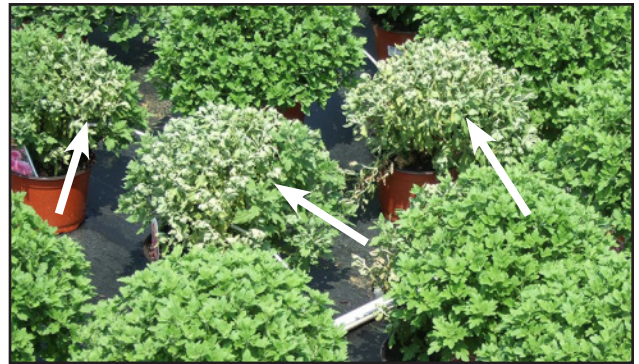
FIGURE 6. WILTING RESULTS WHEN PLANT VASCULAR SYSTEMS COLLAPSE (DISEASED PLANTS AT ARROWS).