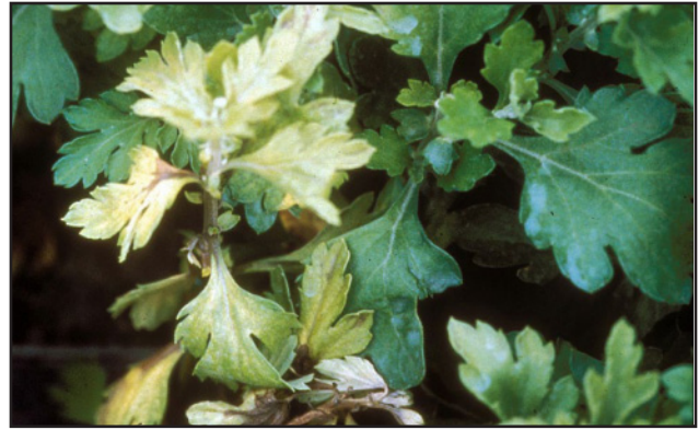
FIGURE 5. FUSARIUM WILT CAUSES YELLOWING AND SUBSEQUENT WILTING.