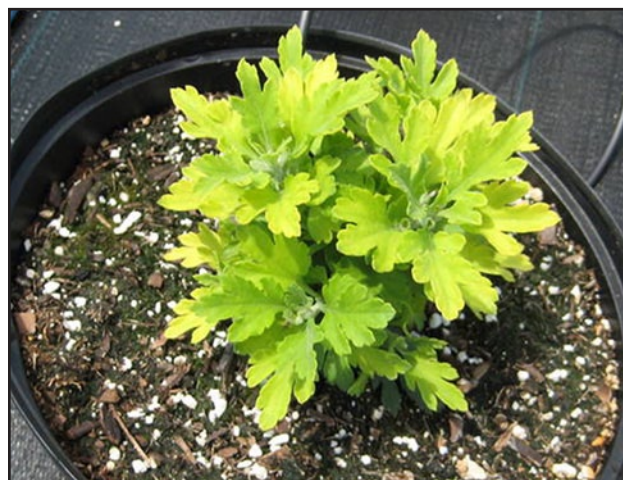
FIGURE 12. CALCIUM DEFICIENCY RESULTS IN NEW GROWTH THAT IS UNDERSIZED, THICKENED, AND CHLOROTIC.

Affected plants are pale green with marginal and interveinal chlorosis of the new growth. Foliage eventually becomes uniformly chlorotic and necrotic spots may develop along leaf margins. Newly formed leaves are smaller than normal and flowering is delayed. As the deficiency continues, lower leaves gradually become necrotic, cup downward, and wilt. Root systems are undersized, but otherwise appear healthy.