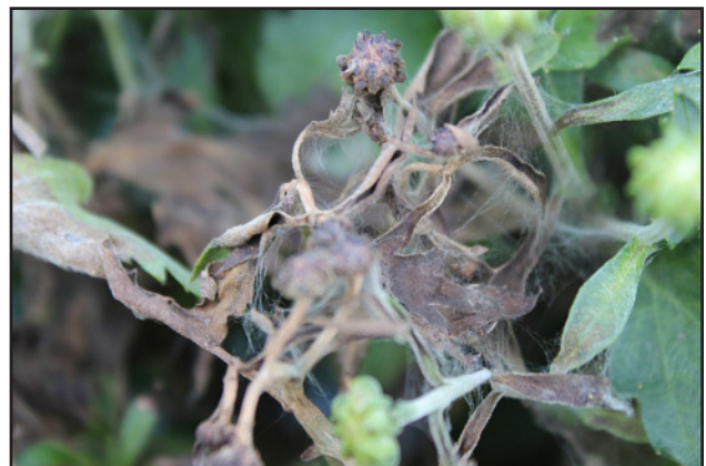
FIGURE 9. (TOP) RHIZOCTONIA WEB BLIGHT PRODUCES DISTINCT SYMPTOMS ON UPPER BRANCHES, LEAVES, AND FLOWERS. FIGURE 10. (BOTTOM) THE FUNGUS PRODUCES MYCELIA THAT APPEAR AS WEBBING.