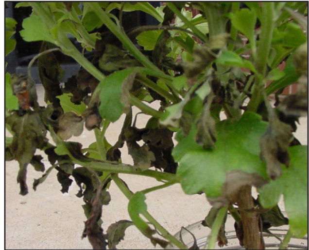
FIGURE 3. BACTERIAL LEAF SPOT SYMPTOMS INCLUDE SPOTS THAT RAPIDLY ENLARGE AND COALESCE.