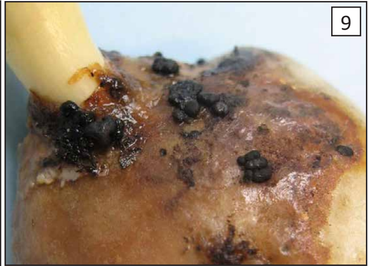
FIGURE 8. PEONY STEM ROT DUE TO BOTRYTIS INFECTIONS. FIGURE 9. BOTRYTIS RESTING STRUCTURES (SCLEROTIA) PRESENT AT THE NECK OF DECAYING ONION BULB.