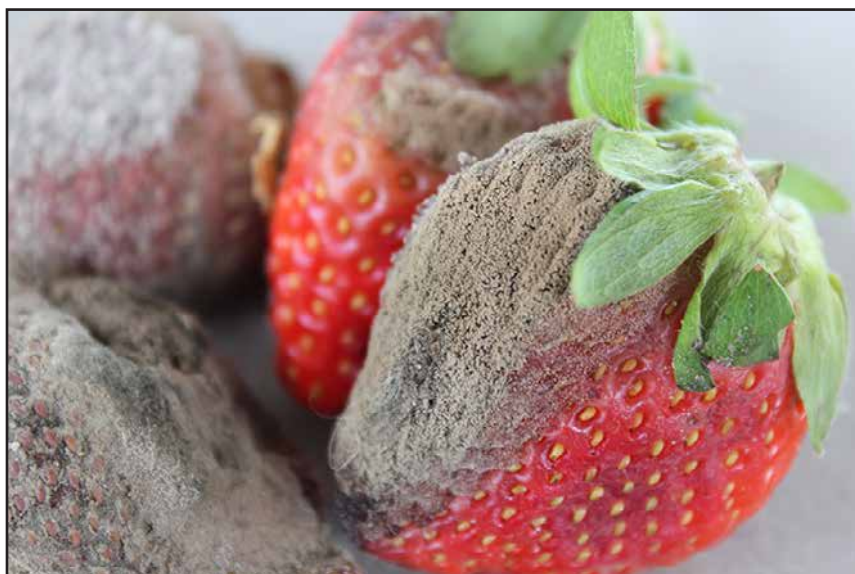
FIGURE 1. THE GRAY TO TAN MOLDY GROWTH CHARACTERISTIC OF BOTRYTIS BLIGHT COVERING INFECTED STRAWBERRY FRUIT.

Botrytis blight may affect seedlings, buds, flowers, fruit, leaves, stems, and bulbs. Symptoms can vary depending on the host and plant tissue infected, but the presence of a distinctive gray to light-brown, fuzzy, moldy growth on diseased tissue is common to all (FIGURE 1). This moldy growth is comprised of fungal strands (mycelia) and clusters of spores (conidia).