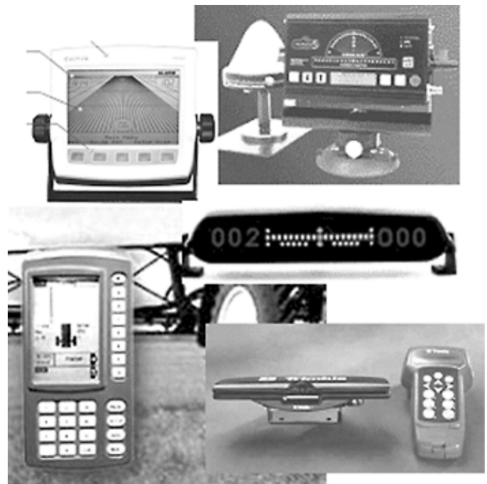
Example Display Configurations

Contour Following. Several manufacturers offer contour or curve following features that could be quite helpful in irregularly shaped fields. These algorithms are becoming more