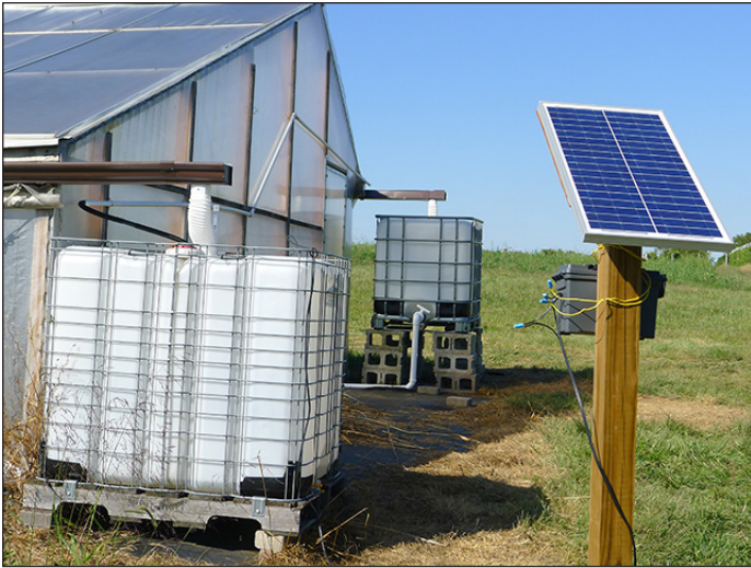
Both gravity and a small solar-powered DC electric pump are used in this rainwater catchment system for drip irrigating this high tunnel in Kentucky.

design a system that meets crop and soil requirements. Equipment and supplies required for effective drip irrigation depend on several factors, including size of the fields to be irrigated, crop water requirements and soil types. In most cases an irrigation professional will be needed to help plan the most efficient system. Pumps and related equipment – such as filters, pressure regulators, valves and gauges – are installed on a system-specific basis. Soil moisture sensors (tensiometers or electronic sensors) should be used to help determine water needs.