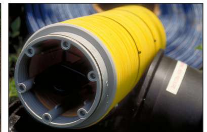
Above left: Sand filters are often used with surface water sources. Above right: Disc filters are commonly used for specialty crops on small farms in Kentucky.