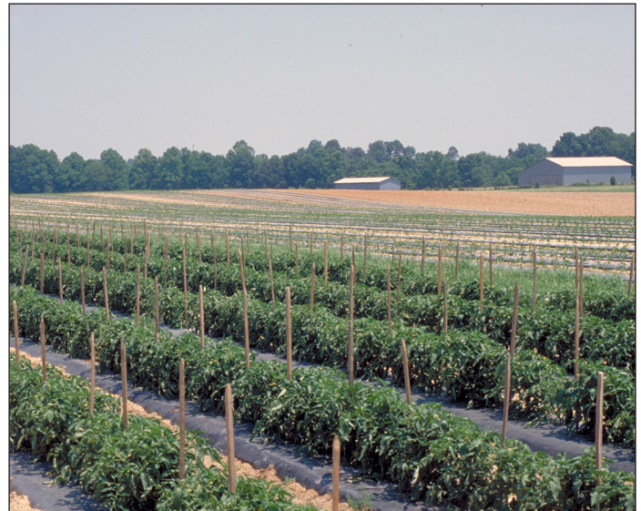
Above: Drip irrigation and plastic mulch are common on staked tomatoes in Kentucky. Below: Irrigation is essential for high-value crops.

Irrigation water may be sourced from wells and municipal water systems as well as surface water such as lakes, ponds, streams and springs. Filters are required for irrigation systems using surface water systems, and backflow prevention devices are required for municipal water. Testing of irrigation water for bacterial contamination, hardness, and chemical properties such as pH, iron and sulfur is advised both as a Good Agricultural Practice to promote food safety and prevent clogging of drip systems. The University of Kentucky Soil Laboratory in the College of Agriculture, Food and Environment