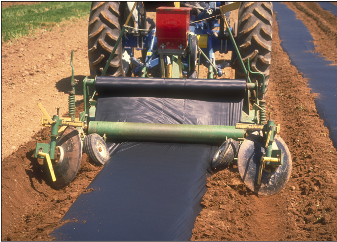
Small farm bed-shaper/plastic layer forms raised beds, lays plastic mulch, and installs drip irrigation tubing in one operation.

Growers using plastic mulches will also need a plastic mulch layer/bed shaper costing from $1,200 to $5,000, depending on size and model. A waterwheel setter, for transplanting into plastic mulch, is also commonly used, costing approximately $2,000 to $2,500. Many Kentucky counties have purchased mulch layers and waterwheel setters to rent or loan to farmers. The expense of renting or sharing this equipment reduces the farm-level investment needed for drip irrigation, making the practice more feasible for small farmers. The cost estimate below uses a 10-year depreciation expense for these two pieces of equipment, or $400 annual cost.