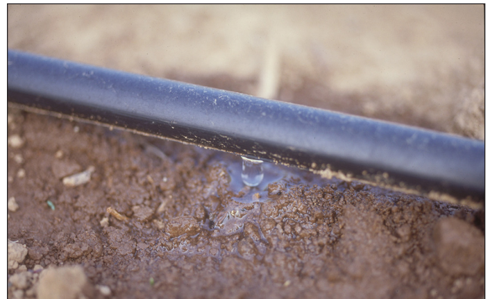
Drip irrigation tubing or “tape” is thin-walled plastic tubing with built-in emitters for slow and precise water application. Drip irrigation wets the soil around the roots and permits application of nitrogen fertilizers directly to the root zone.