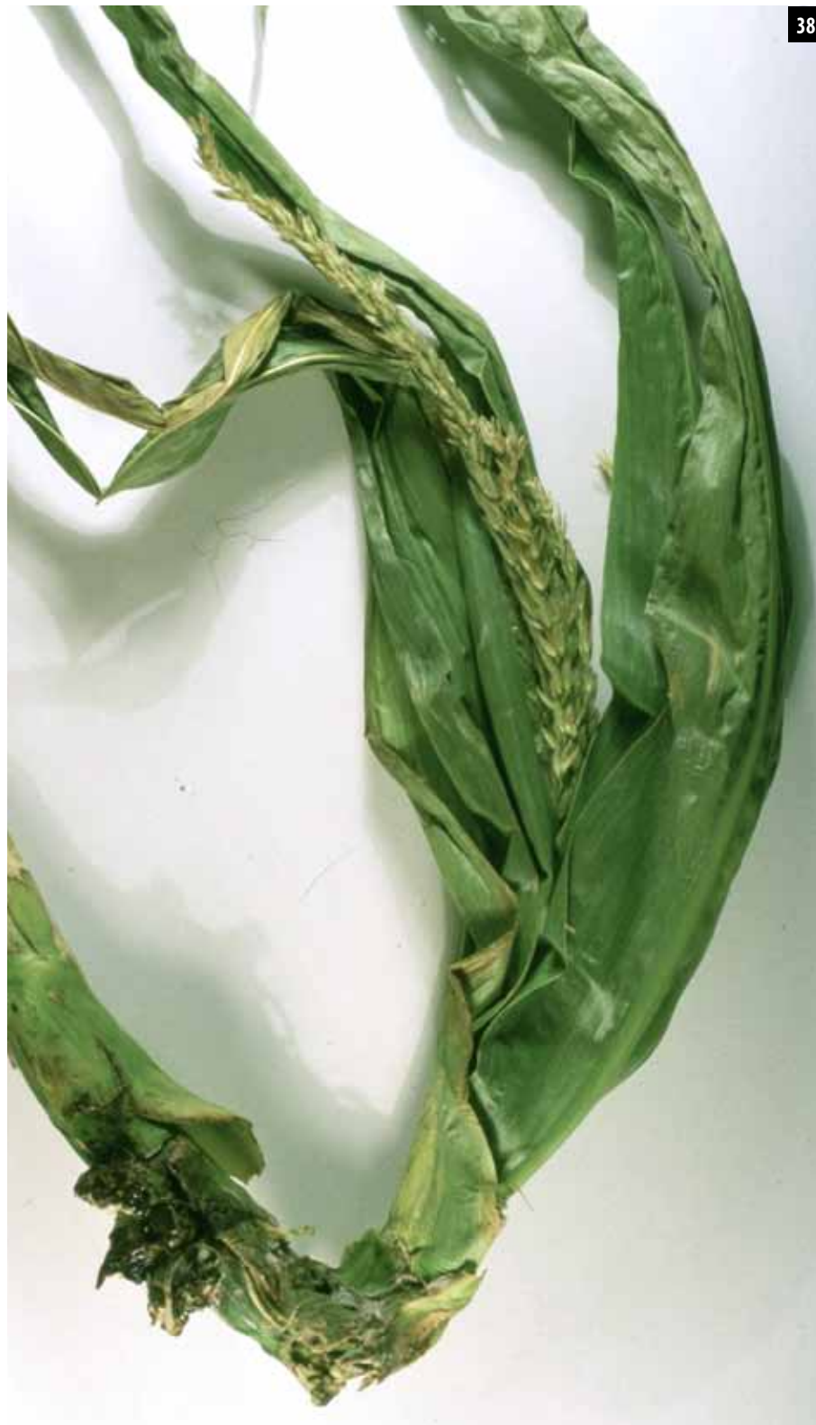
EPTC (Eradicane) injury.

Management —Use a safener and avoid applying prior to heavy rains, which could leach the safener.