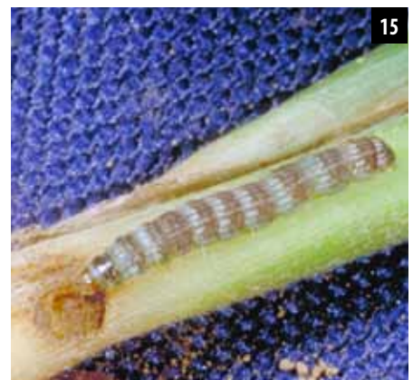
Lesser cornstalk borer on seedling.

15. The lesser cornstalk borer ( Elasmopalpus lignosellus ) is an uncommon pest of sweet corn that can feed on a number of crop plants, but economic problems are usually associated with