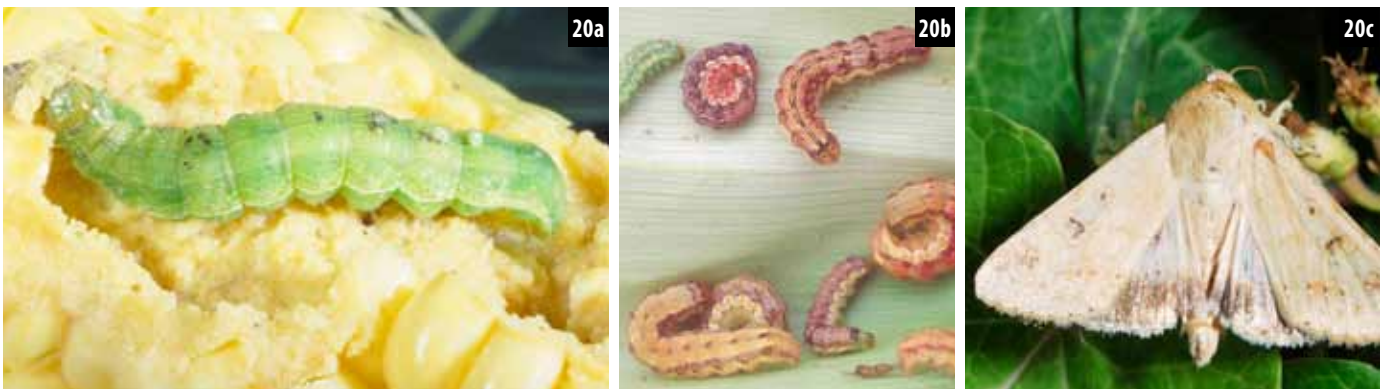
Corn earworm damage (a), color variation among larvae (b), adult moth (c).

21. Fall armyworm ( Spodoptera frugiperda ) is an occasional pest of sweet corn and can be difficult to control. This pest does not overwinter in Kentucky and reinvades from the south each summer. Late-planted fields are more likely to become infested, as this pest will concentrate on egg laying on corn that has not yet silked. Fall armyworm causes serious feeding damage to leaves as well as direct injury to the ear. Like European corn borer, fall armyworm can only be effec-