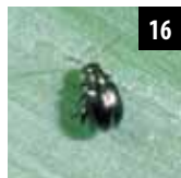
Corn flea beetle.

16. The corn flea beetle ( Chaetocnema pulicaria ) is small, black, hard-bodied insect that hops or flies quickly when disturbed. These pests overwinter as adults and become active in the early spring. Flea beetles attack young corn