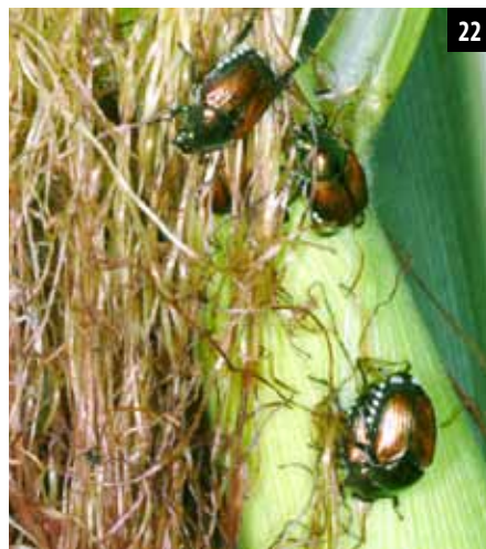
Japanese beetles on ear silks.

24. Corn rootworm adult ( Diabrotica virgifera virgifera , Diabrotica barberi ) is primarily a problem where corn is grown continuously in the same fields. Rootworm beetles begin to emerge