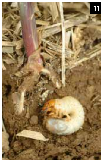
White grub feeding of corn roots.