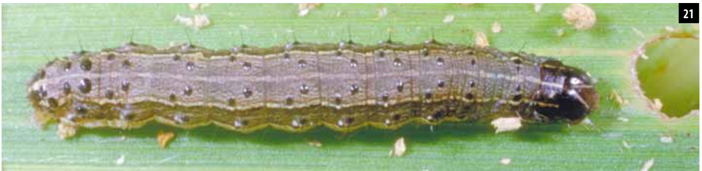
Fall armyworm larva.