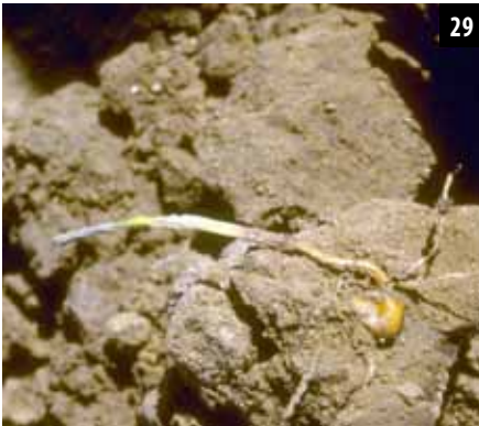
Damping off of corn seedling.

29. Damping-off ( Pythium spp., primarily) is characterized by soft rot of seed before germination or death of seedlings pre- and post-emergence. On emerged plants, a soft and water-soaked necrosis will occur just above the soil line and will extend to roots belowground. Plants wilt rapidly and die.