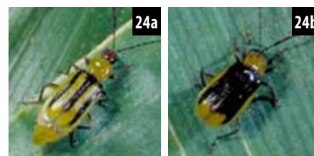
Female (a) and male (b) corn rootworm beetle.

been associated with barren corn, although this connection is uncommon. Corn leaf aphids vary from blue-green to gray and are small (1/8 inch or less) with a dark pair of tubes (cornicles) that project toward the rear.