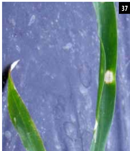
Leaf spotting due to Paraquat (Gramoxone) injury.

37. Paraquat (Gramoxone) is a widely used nonselective contact kill herbicide that is used in burn-down applications or as a post-emergence directed spray to rows. Common injury symptoms include a white "burn" spot where the herbicide has made contact with the plant.