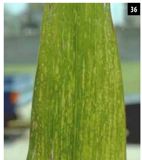
Maize chlorotic dwarf symptoms.