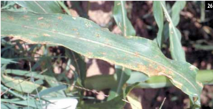
Common corn rust.