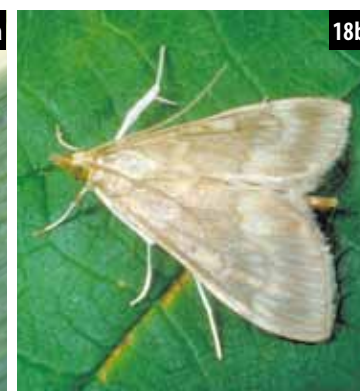
European corn borer larva (a) and adult (b).