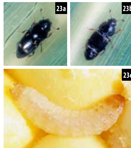
The picnic beetle (a), sap beetle (b), and sap beetle larvae (c).