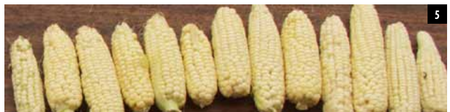
Uneven ear fill.