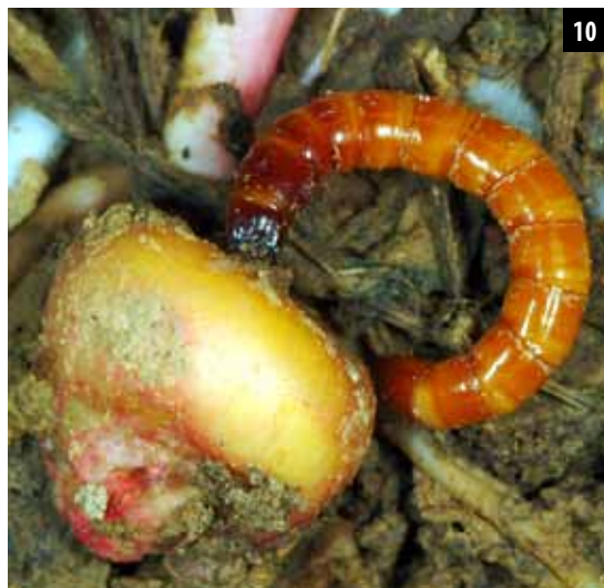
Wireworm attacking a corn seedling.