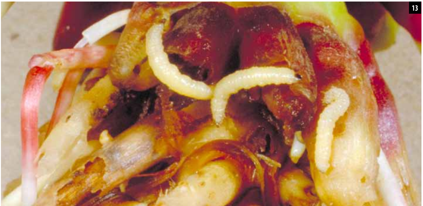
Corn rootworm larvae and characteristic damage to roots.

Management —Early land preparation and good weed control will help reduce cutworm problems. It is important to watch the field closely for cut plants. Early detection means an insecticide can be applied before serious damage occurs. Seed treatments can help reduce the number of cut plants.