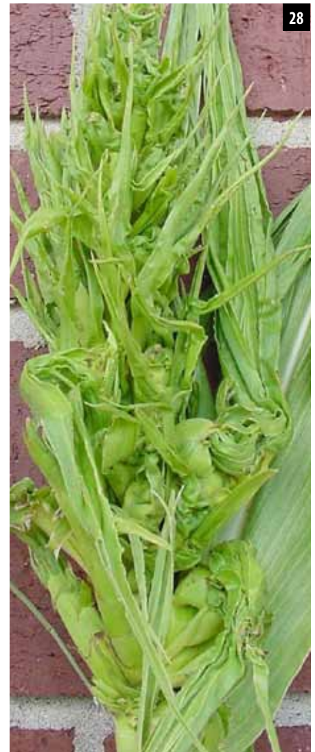
Crazy top of corn.

Management —Adequate soil drainage and resistant varieties.