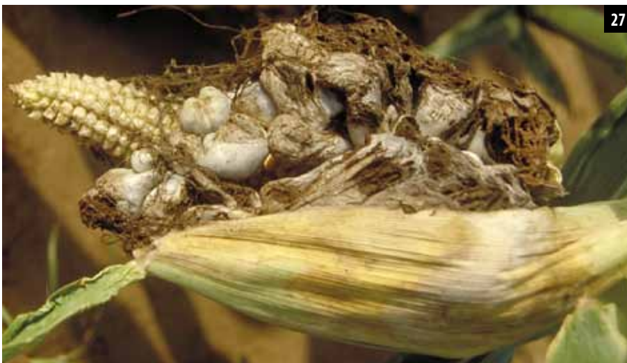
Common smut on ear.

Management —Removal of infected material prior to maturation of galls, insect control, minimizing injury to plants, crop rotation, and resistant varieties.