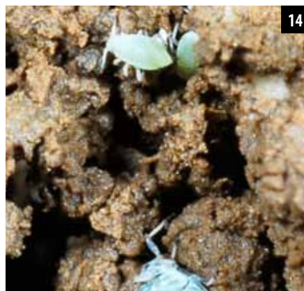
Corn root aphids.

14. Corn root aphids ( Aphis maidiradicis ) are small, wingless aphids that feed on the roots. They are a rare but serious pest of corn, light bluish-green to grayish green in color with a fine