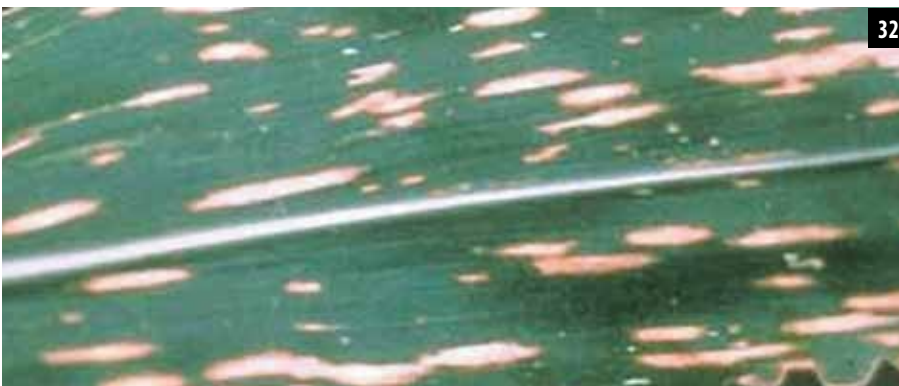
Southern corn leaf blight.

Management —Resistant varieties and fungicides (on later plantings if disease is seen on early plantings or if disease is observed at the whorl stage).