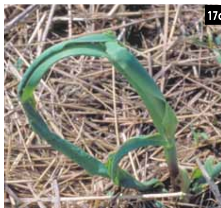
Brown stink bug feeding at base of plant (a). Tillering (b) and buggy whipping (c) due to stink bug feeding. Characteristic dissolved holes across leaf due to stink bug feeding (d).