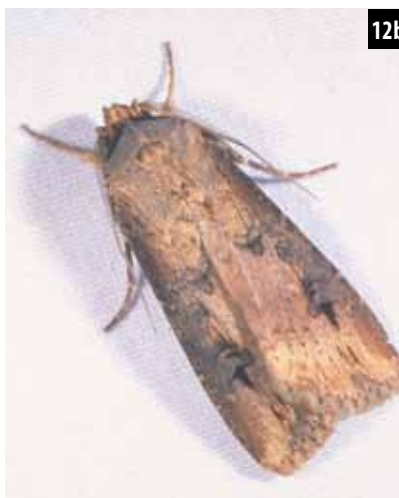
A black cutworm attacking corn seedling (a). Adult black cutworm moth (b).