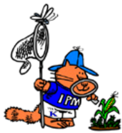
Sponsored by Kentucky IPM

Please contact your local Cooperative Extension agent should you need additional assistance or encounter a problem not included here. Additional information on sweet corn production, fertility, and pest management may also be found in the University of Kentucky publication Vegetable Production Guide for Commercial Growers (ID-36), available from your county extension office or online at http://www.ca.uky.edu/agc/pubs/id/id36/id36.htm .