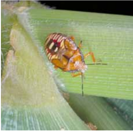
Cover photo: Spined soldier bug nymph on corn ear. This beneficial stink bug attacks and feeds on other insects.