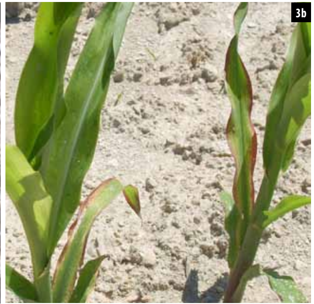
Phosphorous deficiency in corn seedlings (a) and at whorl stage (b).

er pH soils, and cool soil conditions often reduce zinc uptake by plants. When growing early or with plasticulture, sweet corn zinc deficiencies are often observed.