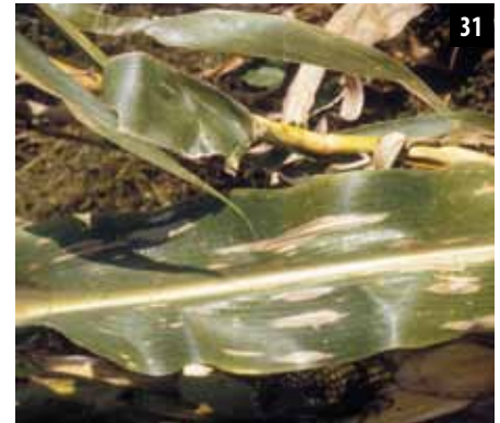
Northern corn leaf blight.

32. Southern corn leaf blight ( Cochliobolus heterostrophus ) lesions are variable in size, depending on the race of the pathogen present and also the variety. Lesions caused by race 0 are elongated and restricted by veins, \frac{3}{4} to 2 inches in length, and tan-colored; a darkened border may be present. Lesions caused by the T race are small, circular to oval in size, and have a reddish brown border. In severe outbreaks, blighting and