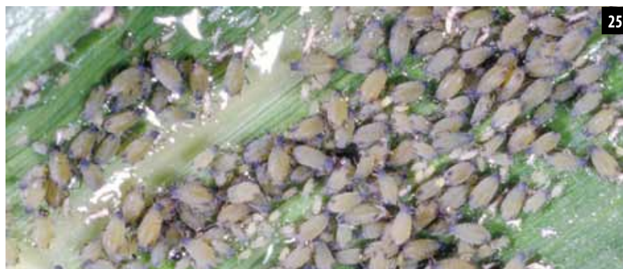
Corn leaf aphids infesting flag leaf of sweet corn.

25. Corn leaf aphid ( Rhopalosiphum maidis ) is very common in whorl-stage corn in Kentucky. It rarely causes yield loss but can be a contaminant in sweet corn. Infestations are more common in late-planted corn. Corn is most susceptible to yield loss by aphids while in the whorl stage. If large numbers are present three weeks before tassel emergence, physiological damage and some yield loss may occur. Excessive honeydew on the tassels may limit pollen shed, and it has