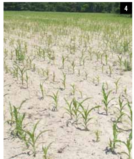
Uneven plant stands due to soil compaction.

Management —Plant corn at proper spacing and in blocks to ensure adequate available pollen. Avoid drought-stressing corn from silking through ear development.