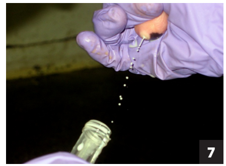
7. Open the collection vial immediately before the sample is taken. Do not let the teat end touch the container or let skin debris or dirt enter the container. Do not put the cap on the floor. Keep the cap upside down and do not touch the inside of the cap so that no debris contaminates the inside of the cap. Hold the collection vial at a 45° angle to keep debris (hair, manure, dirt) from accidently falling into the collection vial. Turn the teat toward the collection vial, striving for direct streams of milk into the vial. The teat should never touch the collection vial or cap. Sample as rapidly as possible, starting with the teats on the near side of the udder followed by the teats on the far side of the udder.