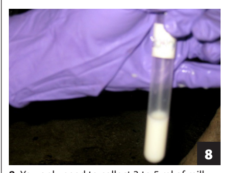
8. You only need to collect 3 to 5 ml of milk (a few streams). Do not fill the collection vial. Attempting to fill the collection vial increases the likelihood of contamination. In addition, if a full collection vial is frozen, it may burst. Immediately place cap on container and seal so it is air tight.