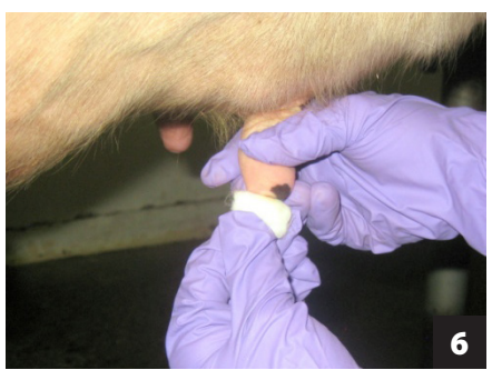
6. For 15 to 20 seconds, carefully and vigorously scrub the teat end and orifice with a cotton or cloth gauze pad moistened (but not dripping wet) with 70 to 80% ethyl or isopropyl alcohol. Use a separate swab for each teat being sampled, even within the same cow. Continue to clean the teat end until the swab is completely clean and white. In order to prevent recontamination of teat ends, clean the teats on the far side of the udder first and followed by the teats on the near side of the udder.