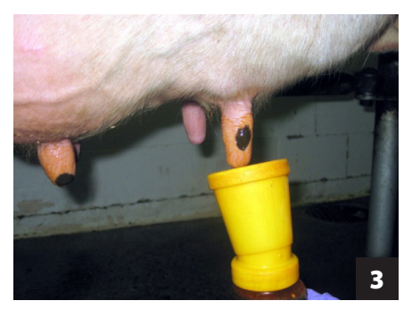
3. Brush any dirt, debris, or bedding particles from the udder and teats. Predip with an effective teat dip (for example, 0.5% iodine or 4% hypochlorite) leaving the predip on the teat for at least 20 to 30 seconds before removal.

2. Remove (forestrip) 3 or 4 streams of milk from the quarter being sampled to minimize chances of sample contamination from bacteria in the teat end.