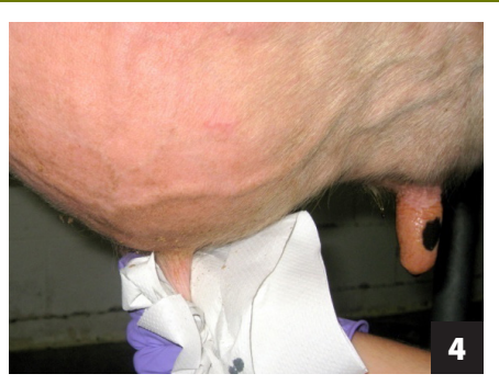
4. Dry each teat thoroughly and remove the predip using a single, dry paper or cloth towel per cow with particular emphasis on the teat end.