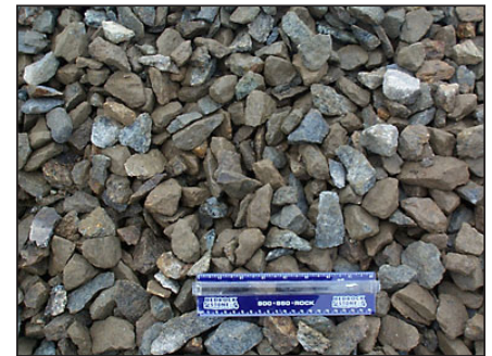
Figure 6. No. 4 crushed limestone.