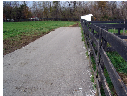
Figure 10. Compacted surface layer.