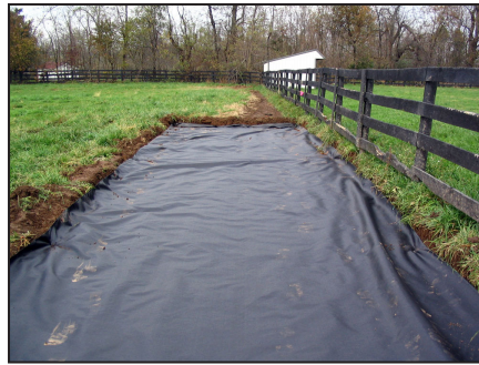
Figure 3. Geotextile fabric in place after excavation.

The base layer of crushed stone creates space for the storage and drainage of water (Figure 5). The rocks must be large enough to provide adequate pore space for the water but small enough for easy handling and placement. No. 4 or No. 2 crushed limestone rock (Figure 6) can be obtained from local quarries and serves this purpose well. Other crushed stone sizes and combinations can be used, but individual rocks with a size of 1–1½ inches have been found to be optimal for this application. Take special care to avoid damage to the geotextile during placement of the base layer of crushed stone. Typically the base layer is approximately 6 inches thick but can be thicker if the construction area was overexcavated because of extremely soft soils.