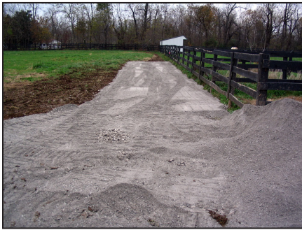
Figure 7. Surface layer of crushed stone.

The final important step of construction is compaction of the surface layer. A small, smooth-drum roller such as those used for small asphalt projects is used to compact the DGA to the desired level and create a durable surface (Figures 9 and 10). Wetting the DGA before rolling will aid in compaction. Small, walk-behind, vibratory “plate” compactors typically compact only a thin portion of the DGA layer and should not be used. Remember that the pad is made of compacted rock and not of concrete. Occasional use of a broad spectrum herbicide will be needed to kill unwanted weeds and grasses. Follow manufacturer recommendations regarding herbicide use around livestock, in particular the proper re-entry period.