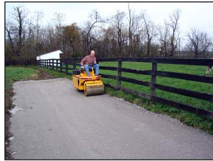
Figure 9. Compaction with drum roller.

Overall, the cost of a high traffic area pad is approximately $0.80/sq ft, opposed to a concrete pad, which would cost about $4.00/sq ft. The cost of the high traffic area pad is broken down in Table 1. Costs can be reduced several ways, most notably by use of a geotextile layer. Using the geotextile reduces by half the depth of rocks needed for stability.