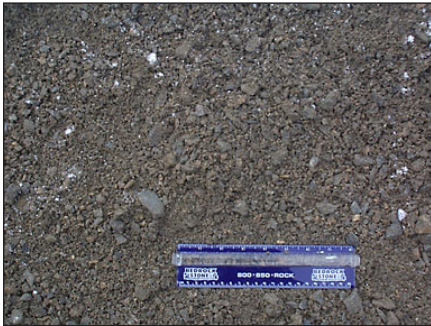
Figure 8. Densely graded aggregate for the surface layer.