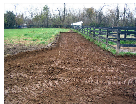
Figure 2. Excavation through the topsoil to stable soil beneath.

The first step in the construction process is the removal of soil from the affected area. The area should be excavated through the topsoil layer until stiff, stable soils are encountered. Extremely muddy areas may require overexcavation to reach a solid layer. A county soil survey book and web soil survey ( http://websoilsurvey.nres.usda.gov/app ) are useful for determining the depth of top soil and the distance to a subsoil. Before removing the topsoil, excavate a few test holes in the area to determine how deep you will need to go. Typically, about 9 inches of soil must be removed from the area to reach a solid subbase for pad construction. Knowing beforehand how much topsoil will be removed will allow you to determine how much rock will be needed. The excavated soil may be used to landscape other areas on the farm to aid in water flow control. Be aware that excavated soil expands to a greater volume than does compacted soil. Also remember to cut away soil directly under fences to give clean, distinct lines for placing the fabric and rock.