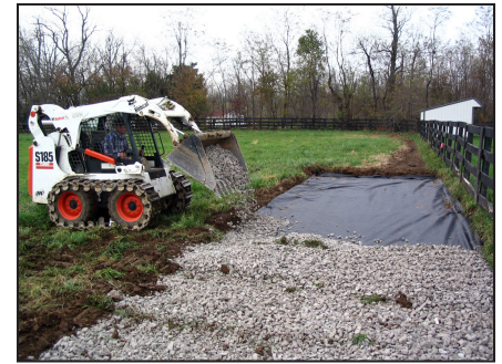
Figure 5. Base layer of crushed stone.

A layer of densely graded aggregate (DGA) (Figures 7 and 8) is used as the final surface material on the pad. Crushed stone mixes consisting of smaller gravel mixed with fine or some 57s in DGA can also be used. Sand has been used for the surface layer, but it tends to shift easily and does not provide firm footing for the animals. Once compacted, the DGA creates a roadlike surface that is easier to walk on than loose gravel but has some flexibility, which reduces the risk of hoof injuries. The compacted DGA also allows for easier cleaning of the surface. The surface layer is typically 2–3 inches deep and should be spread evenly and graded with a slight slope to allow the water to flow away from the pad.