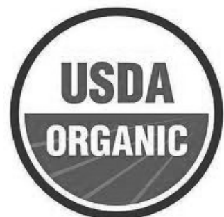
Figure 21.1. USDA Certified Organic label.

The U.S. Department of Agriculture (USDA) National Organic Program (NOP) defines the rules for USDA Certified Organic production practices. (The label used to designate certified organic products is shown in Figure 21.1. See the USDA-NOP website at http://www.ams.usda.gov/AMSv1.0/nop for additional details). This publication provides an overview of the principles and practices of organic agriculture for the home gardener, whether he or she wants to grow a completely organic garden or adopt select practices to lower input costs and build soil fertility. The fertilizer and pest control strategies in this publication are consistent with spirit of the USDA-NOP guidelines. However, gardeners who want to meet the “letter” of those guidelines should explore the Organic Materials Review Institute (OMRI) list of NOP-approved materials at www.omri.org , or look for the OMRI label when purchasing garden supplies (Figure 21.2).