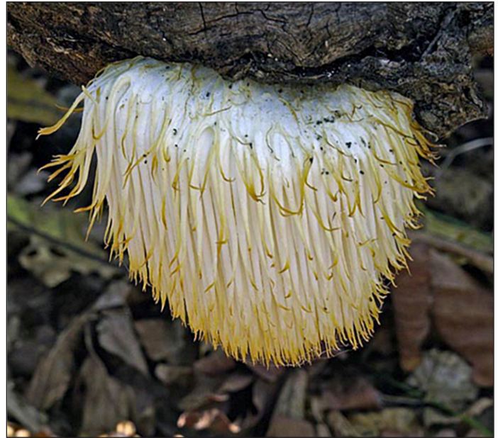
Hericium erinaceus , also called Lion's mane mushroom

Specialty mushrooms, still relatively new to the U.S., are popular as a gour-