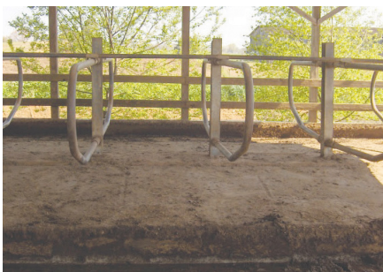
Figure 9. Although mattresses provide cushion for cows, bedding is still essential. These mats have little to no bedding on top.

time was 1.15 hours longer when sand stalls were filled to the top of the curb compared to stalls with sand levels 2.44" below the curb. Although mattresses, waterbeds, and mats may reduce the amount of bedding needed, bedding still must be used to minimize friction while the cow rises from the stall and to absorb moisture ( Figure 9 ).