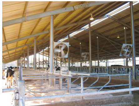
Figure 25. The ideal freestall barn maximizes natural ventilation with high, open sidewalls and a ridge vent opening and supplements natural ventilation with fans used to increase air flow and exchange.

Exhausted air generally leaves the barn through sidewalls or ridge openings. Although old barn designs suggested closed-in barns, current recommendations are to open the barns up to allow for better air exchange. Sidewalls allow for air, heat and humidity to be easily and continuously removed from the barn, which is particularly critical during the summer ( Figure 25 ). If producers are concerned about the potential negative effects of open sidewalls during the winter, sidewall curtains that can be