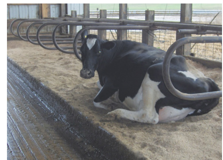
Figure 6. Detached or broken stall dividers or structures can lead to poor stall usage, dirty cows, or cow injury and entrapment.