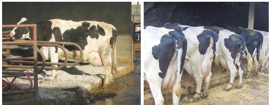
Figure 15. Examples of "perching" with cows standing half in and half out of stalls. Perching may indicate that the neck rail should be moved.

One way we can evaluate neck rail placement is by observing cows for perching behavior. "Perching" is when cows stand with their front feet in the stall and their rear feet in the alley behind the stall ( Figure 15 ). Generally, this behavior indicates improper neck rail placement. When the neck rail is too low, cows will sometimes stand with their head above the neck rail. If the bottom side of the neck rail has a polished appearance, the cows are likely hitting their neck against the neck rail when rising from the stall. If neck rails are too low, cows may also be hesitant to enter the stalls and may have difficulty