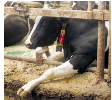
Figure 19. Cows often extend their front leg over the brisket locator while resting. To allow for this behavior, a brisket locator with rounded edges is preferred over sharp or straight edges.

the stall. In mattress or mat freestalls, the brisket locator should be 68 to 72 inches from the rear edge of the mattress or mat. In deep-bedded freestalls, the brisket locator should be 68 to 72 inches from the cow side of the rear curb. The best brisket locator is one that provides the cow with an opportunity to extend her front leg over the locator while resting ( Figure 19 ).