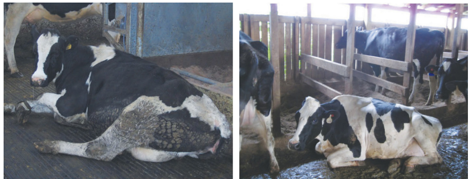
Figure 1. Cows choosing to lie in the freestall alleys rather than in the stalls may indicate that the freestalls do not provide a comfortable resting area.

Do the cows enter the stalls with ease and with minimal hesitation? Do they come into contact with any part of the stall while lying down? Watch cows as they rise from a resting position. Do they come into contact with any part of the stall while getting up? Is there adequate lunge space for their heads as they rise? Do you see any potential for injury as the cows get into and out of stalls? Do cows spend considerable time standing in the stall, showing hesitation, before lying down in the stall? Do they push their nose or mouth against pipes or stall structures? Do cows stand in the freestall, swinging their