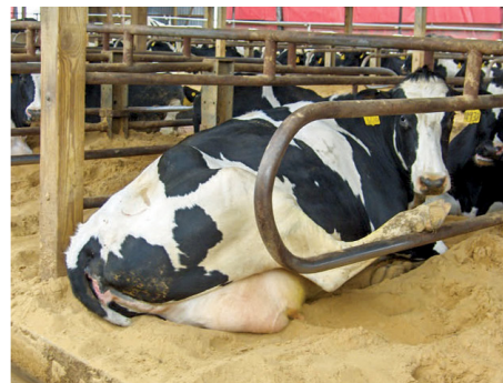
Figure 18. When stalls are too narrow, cows may lie diagonally or come into direct contact with the stall dividers or structures while resting.