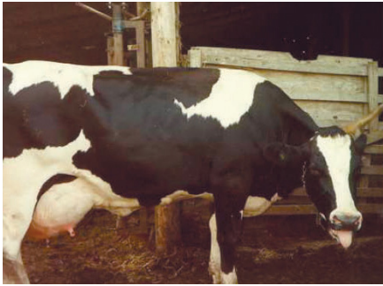
Figure 23. Cows housed in barns with poor ventilation are more likely to be affected by heat stress.

Poor ventilation may result in cows expressing obvious signs of heat stress (i.e. panting, breathing heavily) during warmer temperatures ( Figure 23 ). Cook et al. illustrated that mean lying time decreased from 10.9 to 7.9 hours per day