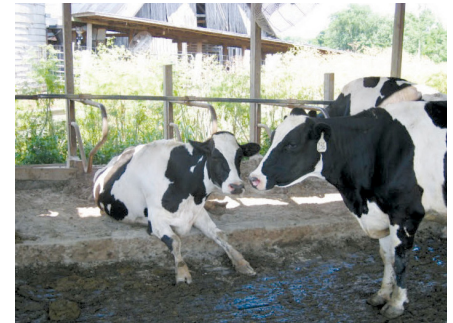
Figure 22. When space is open at the end, cows may be more apt to lie backward in the stall.