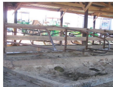
Figure 8. Over time, cows will pull sand out of stalls. Sand must be replaced frequently to maintain a comfortable resting area. This dug-out surface needs more bedding.