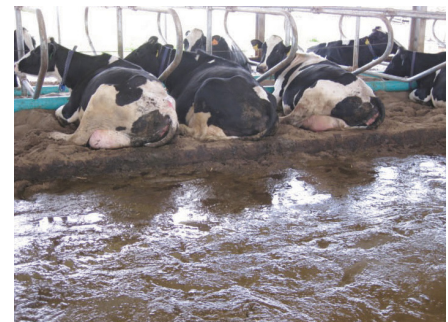
Figure 5. Cow cleanliness problems can often be attributed to infrequent or inadequate removal of manure and urine from freestall alleys.