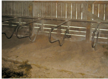
Figure 24. Barns that are completely enclosed do not allow for adequate air exchange, resulting in a damp, dark environment, and can lead to heat stress, respiratory problems, and increased transmission of disease.

When temperatures are cooler, poor ventilation can result in increased respiratory problems and transmission of other