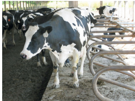
Figure 21. If too much space is left between the stall divider and the rear curb, cows may be able to walk on the stall surface.

The primary sign of having too much space behind the stall divider is the observation of cows walking behind the stall divider on the stall surface ( Figure 21 ). Cows may often be seen lying backwards in the stalls ( Figure 22 ). Both of these behaviors may lead to dirtier stalls. Too much space behind stalls may also increase the likelihood of cows becoming trapped under the stall divider.