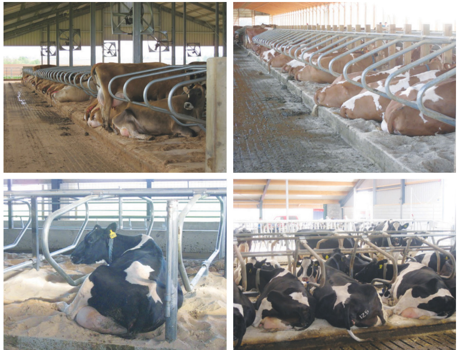
Figure 2. In well-designed and well-maintained freestalls, most cows will be observed resting comfortably or standing straight in the stall. In both positions, cows should be located parallel to the length of the stall.