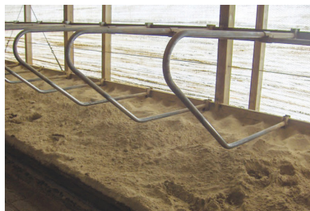
Figure 10. Deep bedding minimizes potential for hock injuries, improves stall usage, and increases lying times. The amount of bedding in these stalls is adequate.