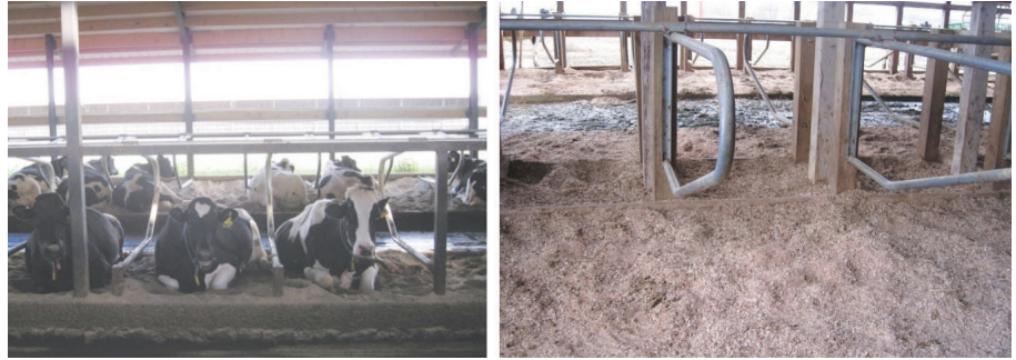
Figure 14. Lunge space can be preserved by keeping the area in front of the cows' heads free of obstructions.

Another possible solution would be to use a stall divider that allows for side-lunging into the adjacent stall. In this case, the lower rail should be no higher