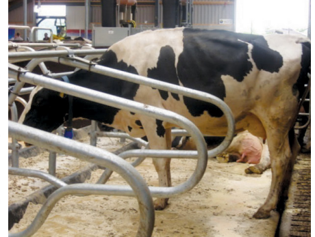
Figure 16. Examples of freestalls with proper neck rail placement. Notice that most cows are standing with their four feet squarely placed in the freestall.

defecate in these stalls, and they had dirtier udders. According to Bernardi et al., cows showed significantly more evidence of lameness when the neck rail was positioned closer to the rear curb. For large-frame dairy cattle, the distance between the top of the stall bed (including bedding) and the bottom