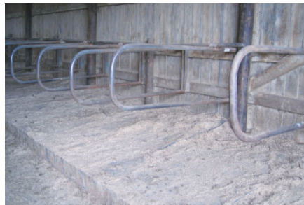
Figure 12. Forward lunge space is often blocked by walls or boards placed in front of the cow's resting space.

Forward lunge space is often blocked by walls or boards directly in front of the cows' heads ( Figure 12 ). Generally, cows prefer to lunge forward when rising from a resting position, and when obstructions are placed in front of the cows, there is no room for their heads to move in this natural rising motion. When cows cannot lunge forward, they may have difficulty rising from stalls or may even become trapped against the wall while rising. Standing or lying diagonally in the stalls may also be a sign of cows searching for a way to preserve forward lunge space. Dog-sitting, where cows sit like dogs with weight placed on the rear end of their body and their front legs extended, may indicate a lack of lunge space ( Figure 13 ). Stalls that lack adequate lunge space are also characterized by overall poor stall usage and may contribute to perching (standing with front legs in the stall and rear legs in the alley).