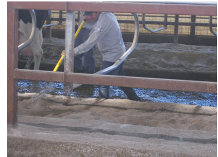
Figure 4. Frequent stall grooming can have a dramatic impact on stall usage and cow cleanliness.

When renovation is not a viable option, it may be best to tear down the existing barn and start over with a new one. When renovation is a viable option, look for the following cow comfort problems in your facility. A description of the desirable situation and potential solutions for fixing the problems are outlined.