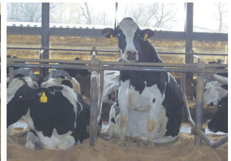
Figure 13. Dog-sitting may indicate a lack of lunge space or other freestall design problems.