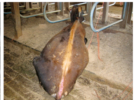
Figure 20. When cows do not have enough space to lie down, they may be found lying diagonally in stalls or half-in and half-out with the front part of their body on the stall surface and the rear part in the freestall alley.