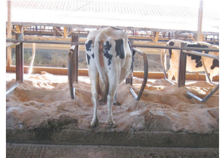
Figure 11. Over time, mattresses may become misshapen or damaged. Check regularly and replace as needed.

of 6 inches of bedding material is required. When mattresses or mats are used, at least 3 inches of bedding must be added to the top of the stall base. Freestalls should be groomed, removing manure and wet areas two to three times per day. Deep-bedded stalls should be leveled at least twice per week. Bedding should be added at least once per week, and possibly once per day depending on the type of bedding used, environmental conditions, and observations of cow cleanliness. Bedding savers may be used to minimize bedding waste.