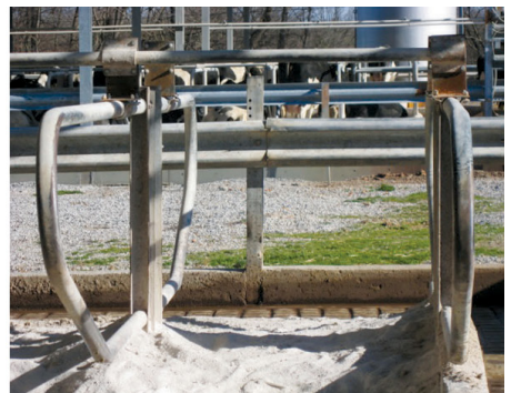
Figure 17. An example of a welded pipe fixture used to raise the height of a neck rail.

up, although caution must be used to make sure that the distance between the divider and the stall base does not leave opportunity for cows to become lodged