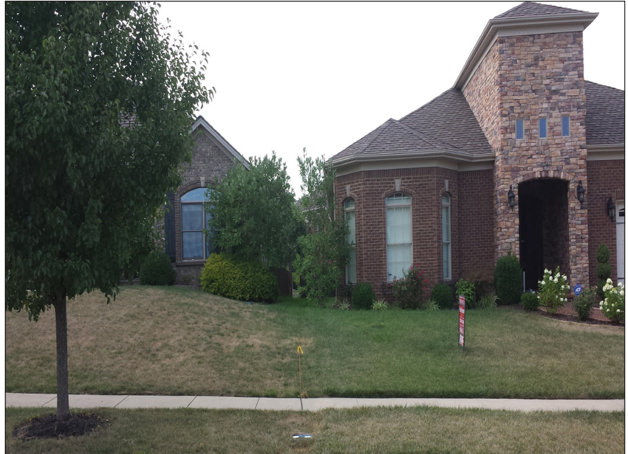
Figure 1. Drought-stressed Kentucky bluegrass (left) and tall fescue (right) lawns. Drought tolerance is only one of the benefits of conversion to tall fescue.