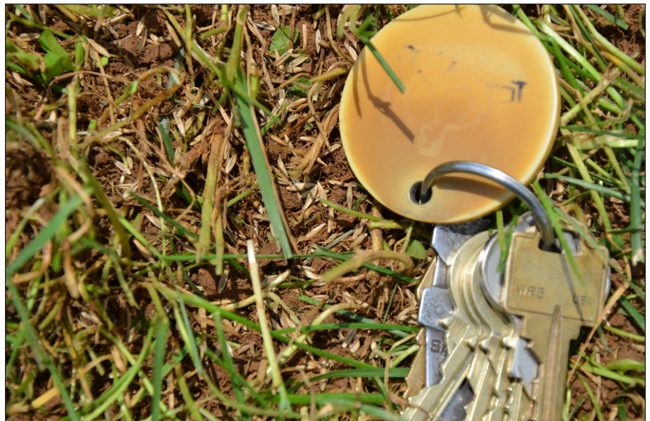
Figure 5. Seeds that lodge in grooves like those above are much more likely to germinate and develop. Without good seed to soil contact, seeds do not germinate, or if germination does occur, the seedlings wither. The seeds above will need to be lightly raked.

Dethatching machines can often be rented from a local rental agency. Use machines with knives or blades. Spring-tine machines or tines added to your rotary mower are not effective at removing organic material and creating slits in the soil. If a large amount of organic