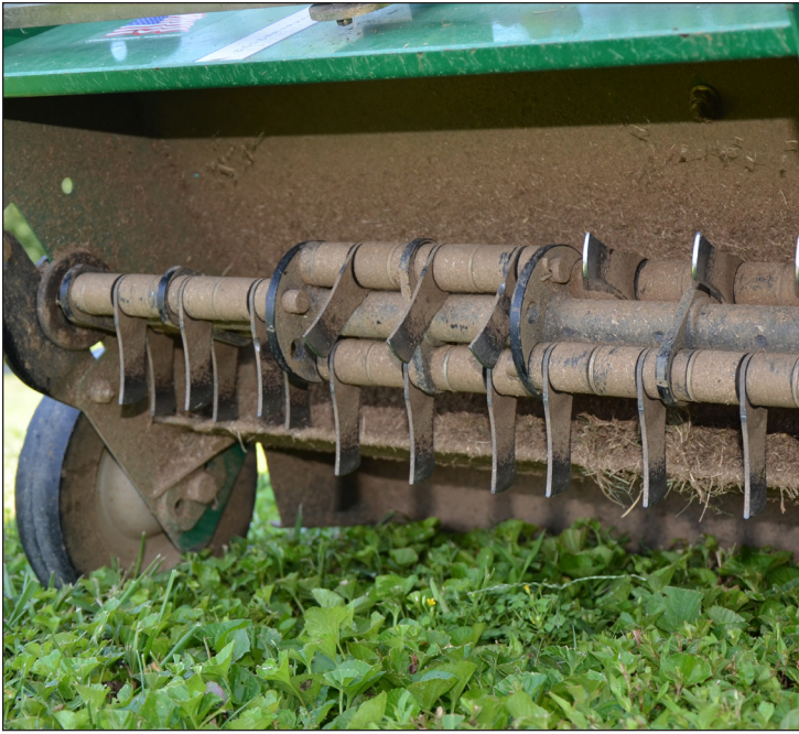
Figure 3. The underside of a dethatching machine showing the sling blades that remove thatch and create small furrows in the soil.