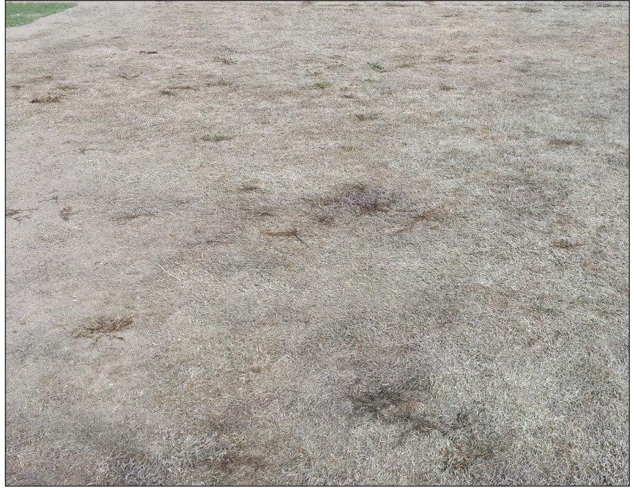
Figure 2. Glyphosate, a nonselective herbicide, can be used to kill most weeds. The resulting dead vegetation will help hold moisture, control erosion, and reduce mud until the grass is established.

Snow seeding—the practice of applying seed over snow in the hopes that the seed will find its way to the soil surface