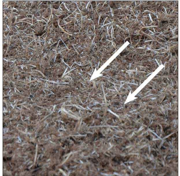
Figure 4. The dethatching machine will not dislodge all vegetation or thatch but should penetrate the soil as deeply as possible and create small grooves for seed. Arrows show trenches created by dethatcher.