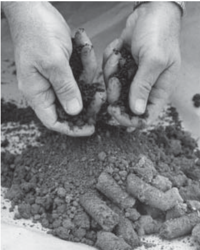
Figure 4. Break up clods while a sample is moist, and spread out to air dry in a clean area.

After all cores for an individual sample are collected and placed in the bucket, crush the soil material and mix the sample thoroughly (Figure 4). Allow the sample to air dry in an open space free from contamination. Do not dry the sample in an oven or at an abnormally high temperature. When dry, fill the sample container with the soil (Figure 5).