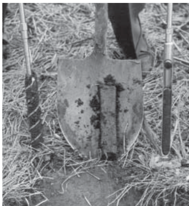
Figure 1. A soil probe, auger, or spade and knife should be used in sampling soils. The spade sample must be trimmed as shown.

agement practices (Figure 2). For example, a portion of a field may have a history of manure application or tobacco production while the other part does not. Phosphorus and potassium levels will likely be higher in these areas, causing the rest of the field to be under-fertilized if the field is sampled as one