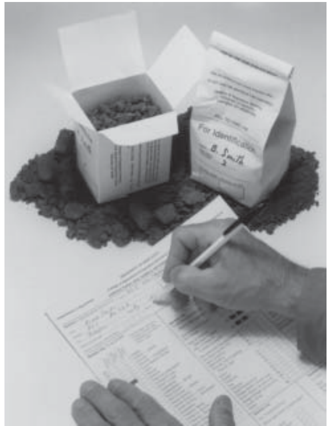
Figure 5. Thoroughly mix the air-dried sample, fill the sample bag or box, mark with your sample designation, fill out the information sheet, and take the sample to your county Extension office.