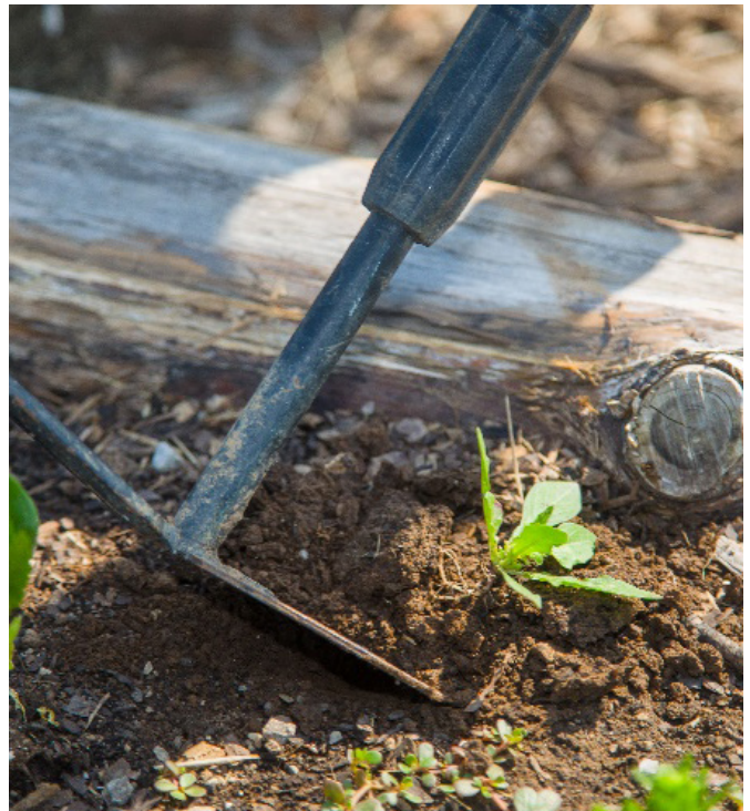
Remove weeds with a hoe by scratching the soil under the weed and pulling up. This method removes the entire plant, including the roots.

Mulching can also help control weeds. Mulch placed between plants shades the soil and helps prevent weeds from sprouting. Several types of mulch can be used, such as leaves or grass clippings. Large leaves should be shredded so they don't form a water barrier on the surface of the soil. Paper materials such as newspaper or cardboard make good mulch. These mulches will also add organic matter to the soil if they are turned under with a shovel at the end of the growing season.