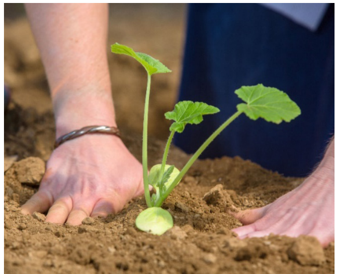
Fill the hole with the remaining soil and press firmly around the transplant.