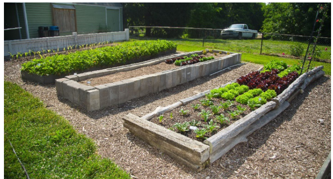
A structured raised bed using wooden beams (right) and cinder blocks (left).