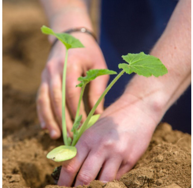
Place the transplant in the hole and make sure the hole is deep enough for the roots.