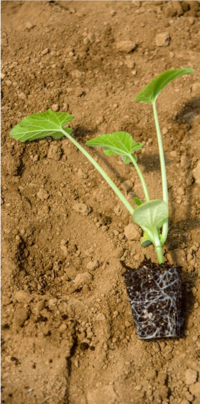
A healthy transplant showing several true leaves and the roots growing around the potting soil.

Most vegetable crops need about 1 inch of water per week. Without rain, you will need to water your garden. To tell whether your plants need to be watered, push your finger about 1 to 2 inches