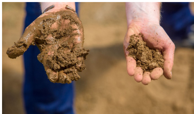
Soil that is too wet for planting (left) and soil that is ready for planting—moist but not clumped (right).

Use a shovel to loosen the soil. Try to dig down 10 to 12 inches. Put the shovel blade into the soil and turn the blade or pick up the shovel to turn the soil. Repeat throughout the garden space. Break up the clumps and clods with a rake or hoe. Remove large sticks and rocks.