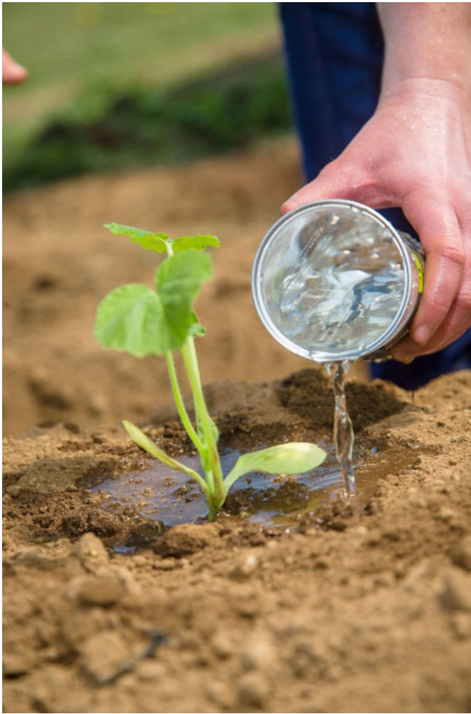
Water the base of the plant, not the leaves.

down into the soil near the base of a plant, about 1 to 2 inches out from the stem. Do this in several places in the garden. The surface of the soil may look dry but be moist underneath. If the soil feels dry or not very moist, provide water. When watering, aim for the roots of the plant, not the leaves or top portion. The roots take up the water, not the leaves. Newly transplanted crops may need to be watered more frequently to help them become established in the soil.