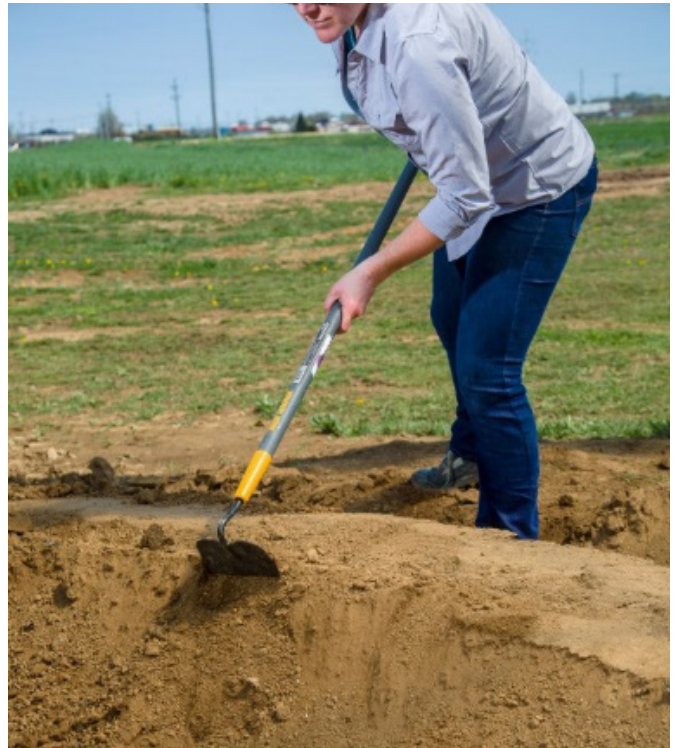
An unstructured raised bed that has been formed by mounding the soil and shaping it.

Once you have prepared your soil, begin to form raised beds. Raised beds allow for better water drainage and let more air enter the soil, which improves plant root growth. If you plan on having more than one raised bed , space them far enough apart so that you can walk between them. About 36 inches from the center of one bed to the center of the next bed is common. The top of the bed should be level and about 8 to 12 inches wide. You can make both the bed width and walkway smaller or wider if you wish. You should be able to reach across the top of the bed and walk between the beds.