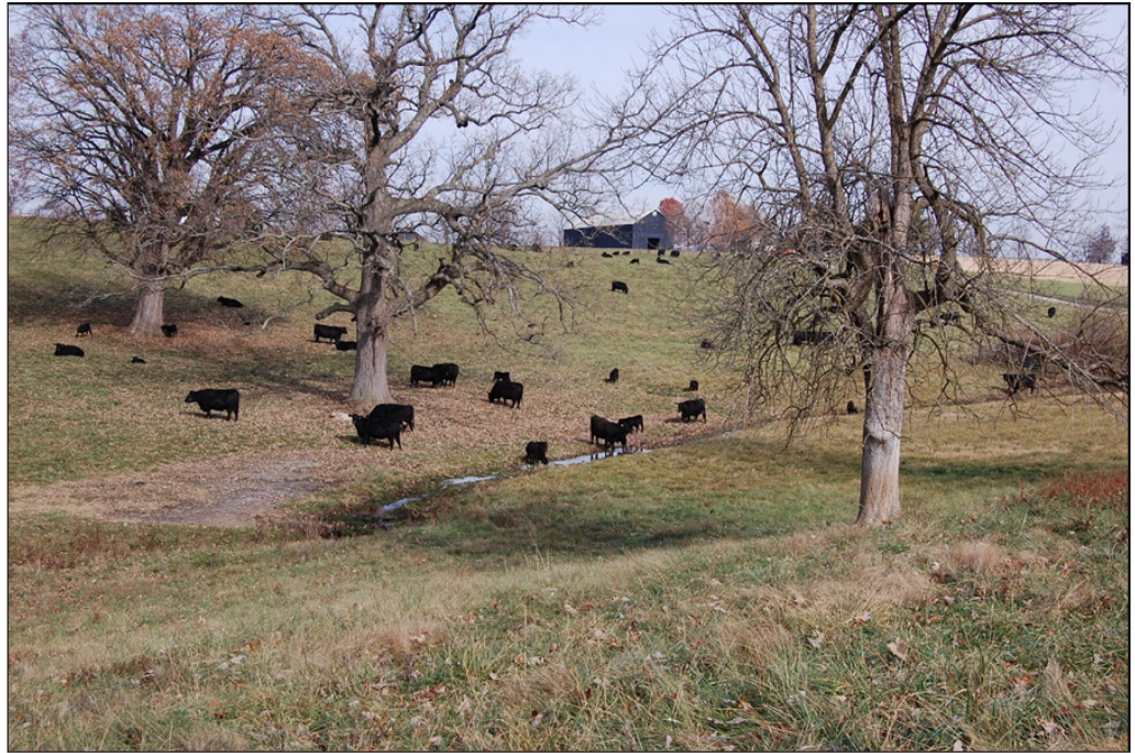
Figure 1. The combination of shade and water in riparian areas is a natural lure for cattle.

Limiting the access of cattle to ponds and streams using heavy-use area ramps and fencing has been suggested as the lesser of the two evils when a stream or pond must be used as a water source. This approach is simple and inexpensive, especially when state or federal cost-share will design and fund the practice. Bank erosion is re-