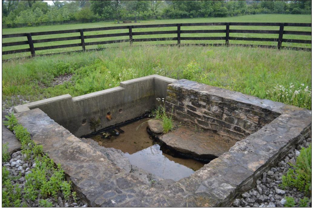
Figure 3. Developing springs can provide producers with an inexpensive, clean water source. Depending on their location, developed springs can be used to deliver water away from sensitive areas by gravity flow.

approach minimizes erosion, thereby extending the life of the pond. It keeps the cattle out of the pond and reduces sediment and turbidity. Cattle that do not have access cannot fall through ice, get stuck in mud, or drown. Hoof problems and water borne disease transmission are greatly reduced. Overall water quality is improved. Producers need only establish the system, provide maintenance, and make sure that the watershed area leading to the pond is free from pollutants. Again, cost-share opportunities are available to design and fund this type of practice, providing that the topography and site conditions are suitable.