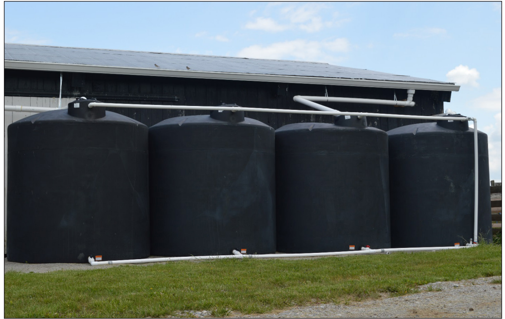
Figure 4. Harvesting water from a roof can provide producers with an alternative water source that is both clean and inexpensive.

Producers can gain significant cattle production and health benefits by providing city water to fountains, tanks, and troughs. Properly located features can provide environmental benefits. Studies have shown that stream banks and water quality in streams can be improved by providing what is called “alternative water”—alternative in that the cattle are provided an option other than surfacewater. City water, a developed spring, and delivered water are just some of the options for alternative water sources. Figure 5 shows a tire waterer that has been installed to provide plentiful, clean water.