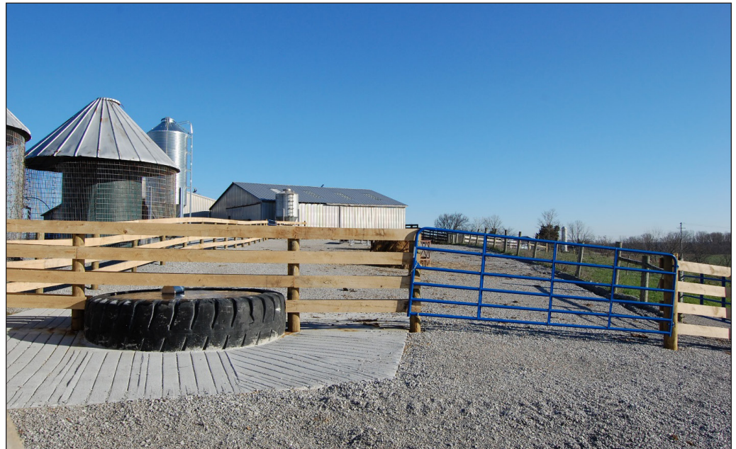
Figure 5. Large volume tire waterer tank installed in heavy-use area.

The location of a watering source is critical. Watering sources can influence grazing, compaction, and manure/nutrient deposition patterns. The watering source should be placed on a summit position because a high site should contain well-drained soils. The key is to choose a location that isn't heavily erodible, without the potential to create runoff that can pollute nearby water sources. Mineral