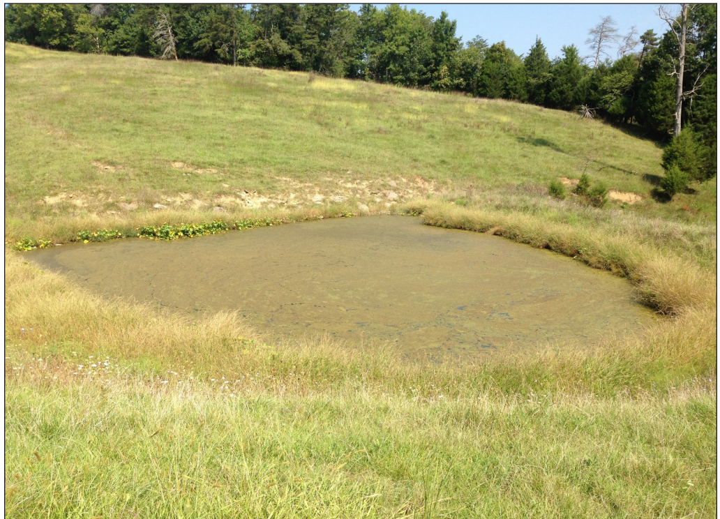
Figure 2. Algal blooms are common occurrences in farm ponds. Not all algal blooms produce toxic compounds; however, it would be advisable to avoid using ponds with visible algal blooms for drinking water for livestock.

duced since livestock do not have full access to the water source. Limiting access also means that sediment, nutrient, and bacterial loading are reduced, although not eliminated. Water quality may still negatively affect animal production.