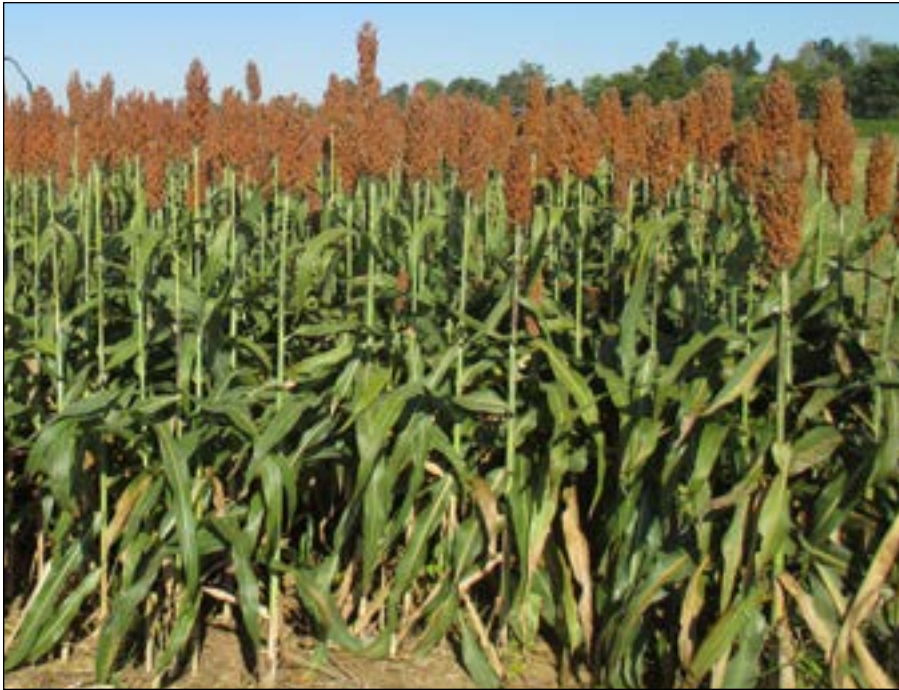
Figure 1. Grain sorghum ( Sorghum bicolor )