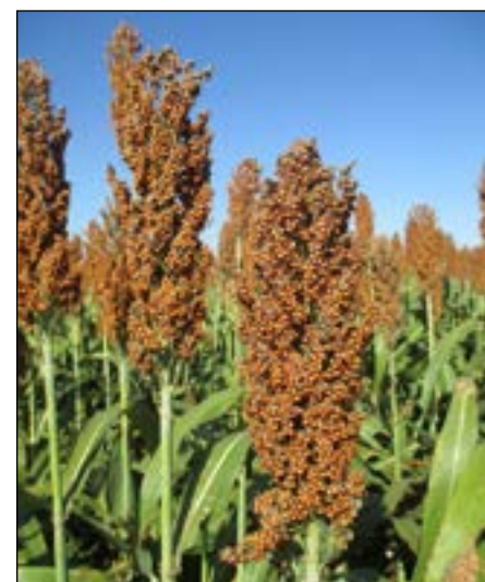
Figure 3. Grain sorghum hybrid with a large head exsertion (distance between the bottom of the sorghum head and the flag [top] leaf)

The characteristic phosphorus deficiency for grain sorghum seedlings is purple leaves. It is not uncommon for purple upper leaves to occur early in the growing season due to cool environmental conditions. This transient phosphorus deficiency will disappear as temperatures increase and roots begin to grow. Larger grain sorghum plants with a mild phosphorus deficiency will be less vigorous with delayed maturity; young leaves will be dark green, have closer internodal