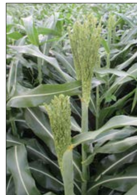
Figure 5. Emerging grain sorghum panicles

Insect management is essential when producing grain sorghum in Kentucky because there are several insect pests that can negatively impact grain sorghum