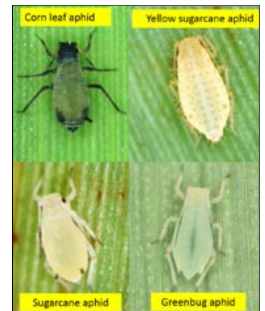
Figure 7. Other aphid species pests of sorghum

Scouting and identification of grain sorghum insects, including economic thresholds for each insect pest, is discussed at length in IPM-5: Kentucky Integrated Crop Management Manual for Field Crops—Grain Sorghum ( http://www.uky.edu/Ag/IPM/manuals/ipm5s-org.pdf ).