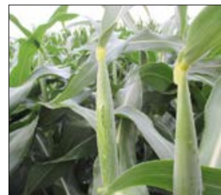
Figure 4. Grain sorghum plant at boot growth stage. Note the swollen flag leaf sheath of the right plant and the swollen leaf sheath and visible panicle of the left plant.

In conventional tillage systems the best options for weed control are field cultivation and chisel plowing followed by herbicide applications. In no-till production systems weed control programs that include herbicides for “burndown”