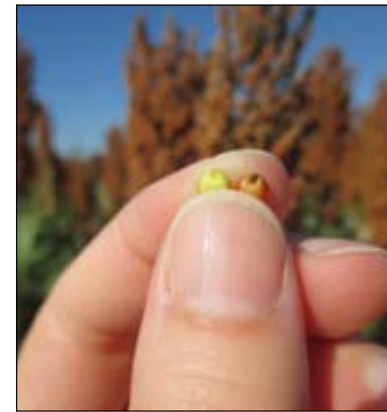
Figure 6. Grain sorghum kernels at hard dough stage (left) and at black layer (right)

yield and quality. Insect pests are generally divided into two groups: those that effect the grain directly and are indirect feeders, and those that feed on the leaves and stalks and generally reduce the vigor of the plant and the flow of nutrients to the grain heads.