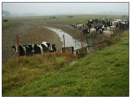
Figure 2. Cattle with full access to this stream have denuded vegetation, damaged stream banks, and polluted water resources.

Lagoons and liquid storages need to be managed to minimize the amount of clean water that can enter the system. Clean water reduces storage capacity, and-if not accounted for-this extra water can cause an overflow. Diverting clean water from roofs and headwaters away from storage structures and inspecting gutters and downspouts to make sure they are in good working order can help preserve storage capacity. Regulators require a manure storage facility to have a capacity that can handle the manure and runoff from the production facilities, normal rainfall events, a 24-hour 25-year storm event (which is about 5.25 inches of rain in Kentucky), and at least one foot