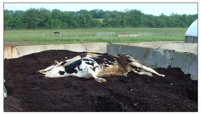
Figure 3. These fallen dairy cows have been placed in a composting structure, which is a good practice for disposing of fallen livestock when the approved state guidelines are used. These animals will be covered with 3-4 feet of bedding material to complete the pile, which deters vermin.