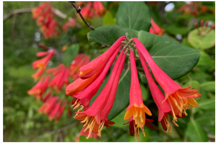
Figure 11. Native L. sempervirens is distinguished from bush honeysuckle by its vine growth form and beautiful bright pick to orange flowers.

the chain or causing a kick back that is dangerous to the operator. A steel brushcutter blade is an alternative method that can provide increased safety and longevity of cutting instrument. Handsaws and loppers are effective options for small and medium sized stems. When implementing this treatment, working in tandem or in small groups is recommended so that the cutting, herbicide application, and dragging brush if needed can be distributed effectively. After being cut, brush can be left in place (and will break down rapidly, within several years) or be stacked to create brush piles that is advantageous for wildlife and for facilitating applicator movement in treated areas.