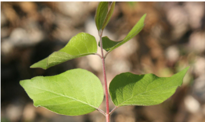
Figure 5. Opposite leaf arrangement with a reddish stem on new shoots.