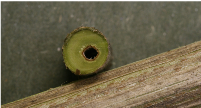
Figure 6. Bush honeysuckle has a hollow pith on smaller stems.