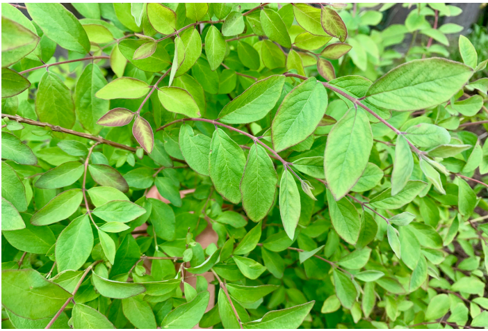
Figure 10. Coralberry leaves and dense shrubby growth form may be confused with bush honeysuckle.