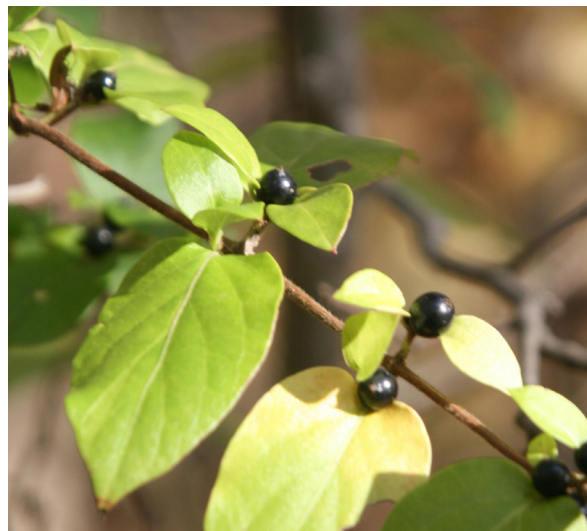
Figure 9. Japanese honeysuckle, an invasive vine honeysuckle with black berries.