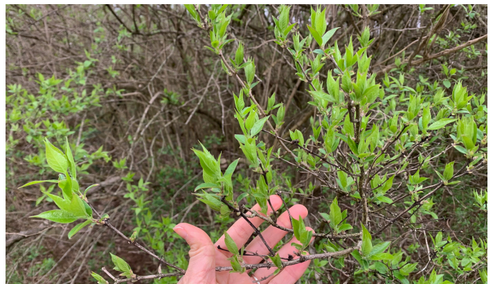
Figure 3. Bush honeysuckle leafing out in early spring.