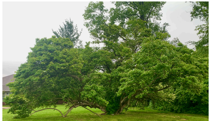
Figure 2. Large landscape bush honeysuckle, over 15 ft tall.