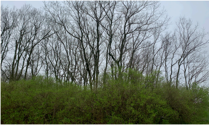
Figure 4. In Kentucky, bush honeysuckle leaf out in early to mid-March, before most other native plants.