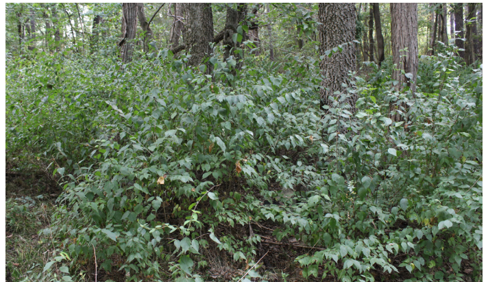
Figure 1. Dense shrubby growth form of bush honeysuckle common in the woodland setting.