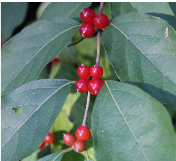
Figure 8. Red berries in the late summer to fall that are favored by birds.