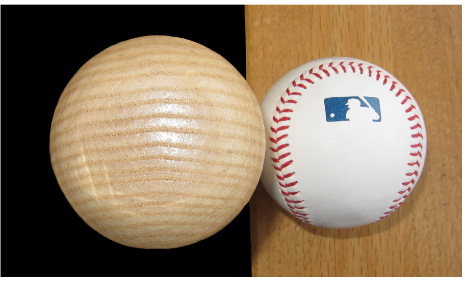
Figure 9-3. This illustration simulates what happens when a ballplayer hits a baseball on a radial surface with the edge of the growth rings pointed toward the ball. The baseball bat is made from a ring porous species, white ash ( Fraxinus americana ).

Backyard baby-boomer baseball players probably know the answer to this question because we rarely if ever owned an aluminum bat. You need to hit the ball with the edge of the growth rings ( i.e. , on the radial surface). If a batter swings the bat against the tangential face the bat will be more likely to break apart than if the radial face is used to hit the ball. See Figures 9-3 and 9-4.