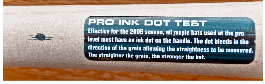
Figure 9-6 . A maple bat (made by Rawlings in 2012) with a drop of ink on the side of the handle to show whether the grain is straight or not; this bat checks out fine.

In addition to the bat orientation, the professional ballplayers themselves have probably contributed to the increasing likelihood of a cracked bat over the years. I can think of two significant changes: 1) ballplayers are more likely to wear batting gloves than they used to, and the bat handles have been made thinner to keep the overall feel of the bat comfortable for the batters; 2) some ballplayers prefer to use lighter bats to increase the speed of their swings. Since bat weight is a function of wood density, the way to get