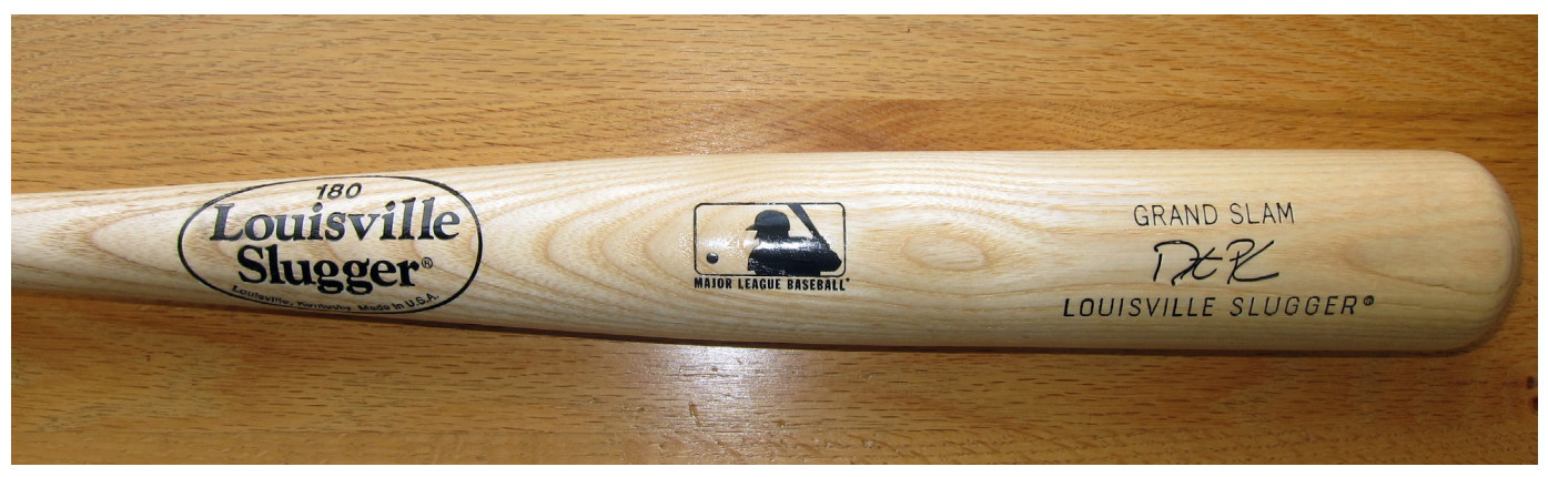
Figure 9-5 . White ash baseball bat. The label is placed on the tangential face, so if the batter holds the bat with the label side up then the ball will strike a radial face (see Figure 9-1). The number 180 in the Louisville Slugger label on this bat means that this is a good quality amateur bat; the best bats (pro grade wood) are marked 125.

If you hit a baseball as shown in Figure 9-3 (on the radial surface, with the edges of the growth rings) most of the impact stress would be sustained by the thickerwalled fibers, not the vessels. This bat would perform well. If you were to hit a baseball with the bat oriented as shown in Figure 9-4 (i.e., on the tangential face with the growth rings perpendicular to the ground), though, you might break the earlywood and the bat could fail. The outer part of the bat could come apart; this is known as flaking or "shelling off."