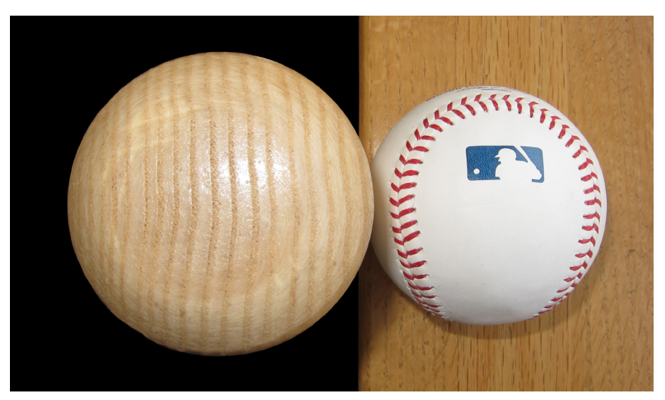
Figure 9-4 . This illustration simulates what happens when a ballplayer hits a baseball on the tangential surface with the growth rings pointed straight up and down. This is the same piece of white ash ( Fraxinus americana ) used in the previous image.