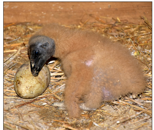
Figure 3. Black vulture nest with a chick and egg present. Matthew Springer, University of Kentucky

tinue the harassment for seven to fourteen days. Even if you are successful in causing the birds to leave the area they may return several weeks or months later and harassment be necessary again.