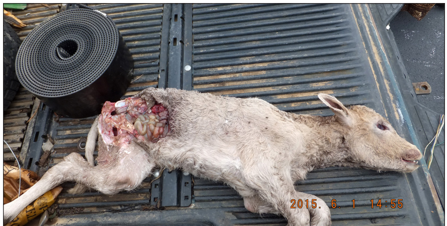
Figure 4. Examples of the damage that can be caused by black vultures and the type of photos necessary to identify black vulture kills. Notice that the rump and eyes were fed upon. The presence of bleeding from the eyes also indicates that the calf was alive before it was fed on. Kentucky Department of Fish and Wildlife Resources