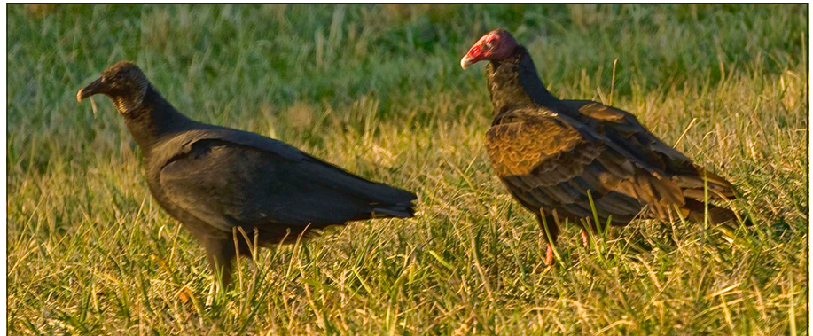
Figure 1. The black vulture (left) has a grey head and slightly darker plumage than the turkey vulture (right). Tom Barnes, University of Kentucky

Vultures play a pivotal role in the ecosystem by feeding upon and thus cleaning up dead animal carcasses. Black vultures are usually carrion (dead animal) feeders.