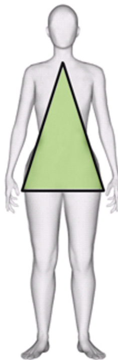
Larger on the bottom

However, petite women (5'2" and shorter in height) need to create a lengthening effect on the lower body. Adding width to the upper body tends to make petite women look shorter. Petite women need to select small prints, use the same fabric on the top and bottom and create a vertical line. They should avoid high collars, large bows, belts, and horizontal patterns.