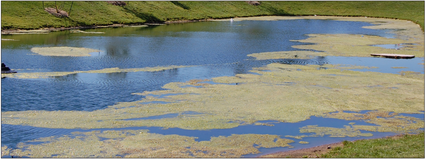
Figure 5. Excessive phosphorus in surface water bodies (ponds and streams) can cause eutrophication (algae-like blooms that may cause fish kills).