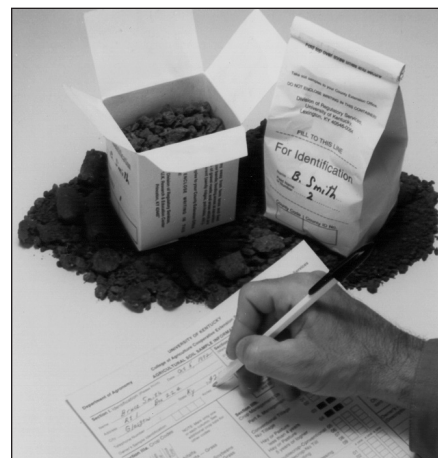
Figure 4. Complete a sample information sheet so the soil analyst can consider desired crop, tillage, and other information when making the fertilizer recommendation. The form contains all the information needed to provide accurate lime and fertilizer recommendations.

Remember that pasture fertilization cannot always alleviate small ruminant macronutrient and micronutrient deficiencies. These problems may be better addressed by feeding appropriate mineral supplements.