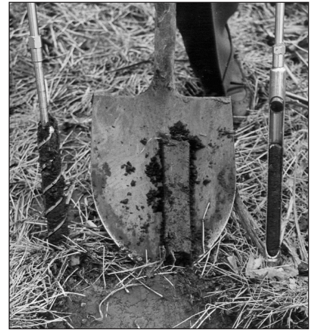
Figure 1. A soil probe, auger, or spade should be used in sampling soils. The spade sample (shown in the center of the picture) should be trimmed as shown with a knife.

An individual sample should represent no more than 20 acres unless your soils, past management, and cropping history are uniform. You can obtain the most representative sample from a large field by sampling smaller areas that vary by soil type, cropping history, topography, and/or erosion/past management practices (Figure 2). For example, manure may have been applied recently to one part of a field but not the other. Phosphorus and potassium levels likely will be higher in areas where you have applied manure. If you sample that field as one unit, the soil test will result in the unmanured part of the field being under-fertilized. Separate samples should be taken from areas that differ because their nutrient require-