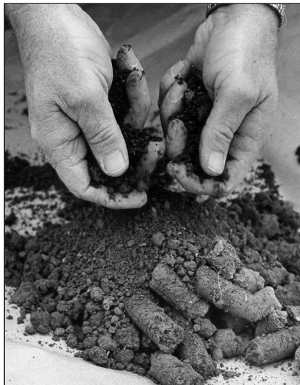
Figure 3. Break up clods while the sample is moist, and spread the sample out to air-dry in a clean area.

Sampling and preparing the soil for submission is only half of the process. The other equally important part is filling out a sample information sheet so that the soil test lab can consider desired crop, tillage, and other information when making the fertilizer recommendation (Figure 4). The form contains all the additional information needed to provide accurate lime and fertilizer recommendations after the lab test results are known. Sample information sheets for the University of Kentucky soil testing laboratories can be found on the web at www.rs.uky.edu . Use the agricultural form when submitting samples from your pastures or hay fields.