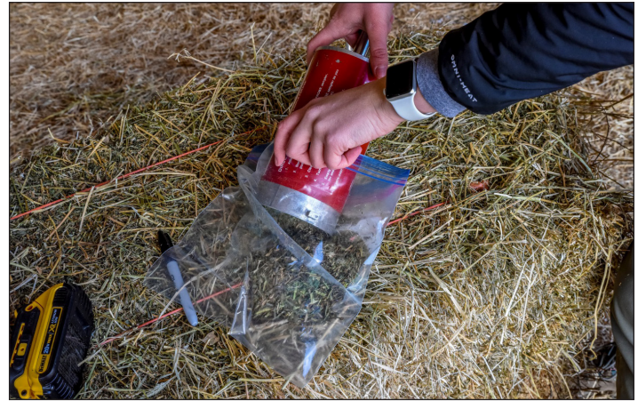
Figure 8. Always submit the entire sample. Subdividing the sample can result in altered lab results since the fine material segregates from the larger particles. Clearly label the bag with all required information.

refusal and should not be included in the sample. The probe should penetrate the bale at least 15 to 18 inches for rectangular or round bales.