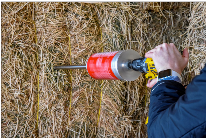
Figure 1. Hay probes are available that attach to a power drill instead of having to be drilled by hand. These designs are much more conducive to large samples than hand-powered options.