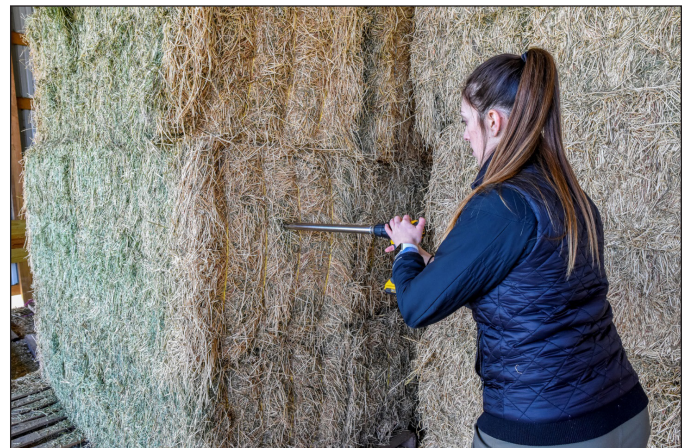
Figure 6. Large and small square bales should be sampled from the ends to a depth of 15 to 18 inches.