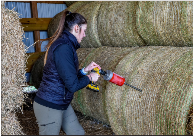
Figure 7. Round bales should be cored from the side to a depth of 15 to 18 inches.