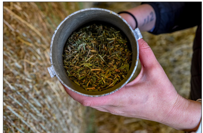
Figure 2. Some hay probes have a canister at the end of the probe to collect multiple samples.