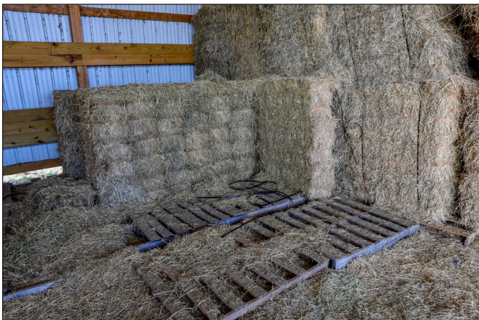
Figure 5. Always sample hay in lots. A lot is hay that comes from the same cutting and the same field.

For round bales, prior to sampling remove weathered material from the area to be probed. Weathered material represents