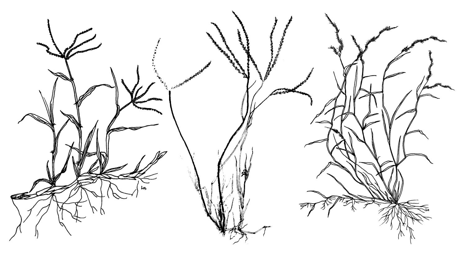
Figure 8.1. Examples of monocots: bermudagrass (Cynodon dactylon), crabgrass (Digitaria spp.), and nimblewill (Muhlenbergia schreberi J.F. Gmel.).

Once you know a plant, you can gather important details about its life cycle and how it spreads within the landscape or garden. With practice, you can learn to distinguish weed seedlings from your planted vegetables and flowers.