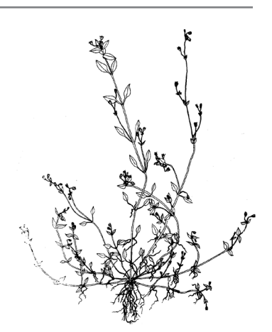
Figure 8.2. Wild violet ( Viola sp.), an example of a dicot.