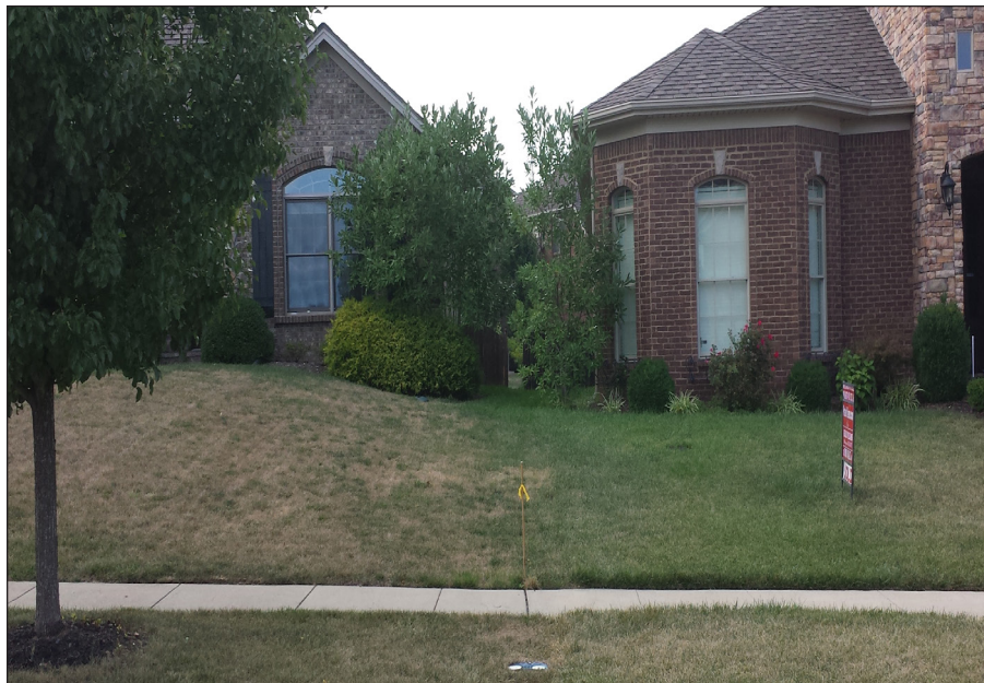
Figure 2. Unwatered Kentucky bluegrass (left) and tall fescue (right) lawns during drought.

Another method to determine when water is needed is to attempt to insert a screwdriver into the soil. If the soil is suf-