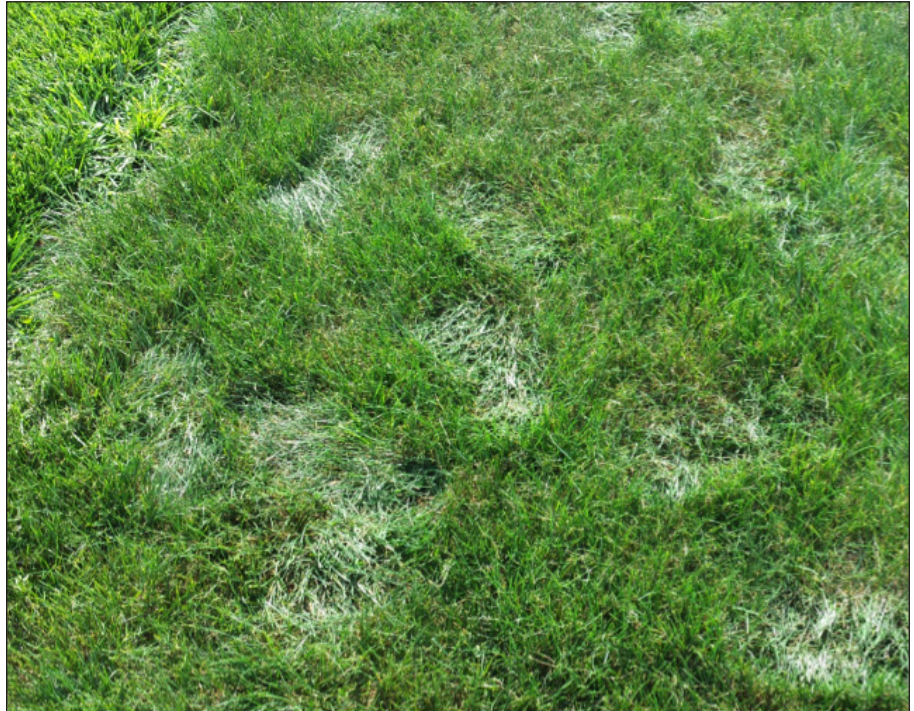
Figure 1. Footprinting on a cool-season grass indicates the need for watering.

Water is also very important for moving pesticides and fertilizer into the root zone. Although water is essential for grass survival, because we have a limited fresh water supply, we must find a balance between keeping grass alive and conserving water.