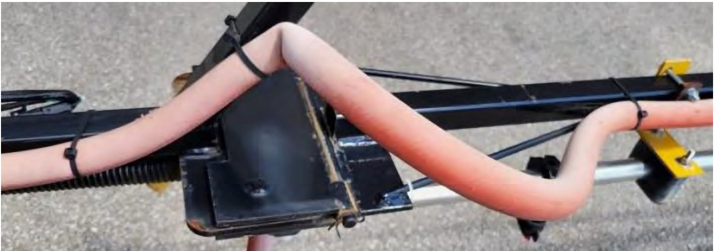
Figure 5. Kinked hose on a spray boom could cause lower pressure and flow in one section of a boom.

relatively inexpensive devices can be used to check the flow rate from a nozzle tip in a few seconds, which makes it reasonable to check all nozzles, even on larger booms. The device will give a flow indication in gallons per minute that can be compared directly to nozzle specification sheets.