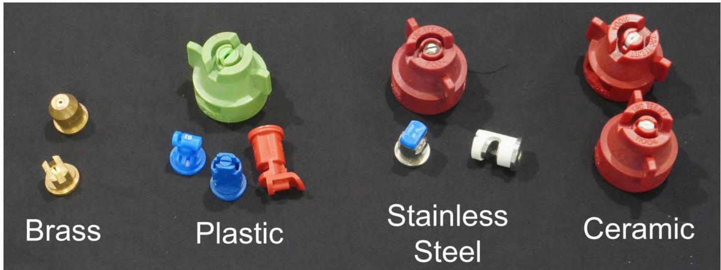
Figure 1. Examples of nozzle tips made from different materials that are commonly used on agricultural sprayers.

Tim Stombaugh, Biosystems and Agricultural Engineering