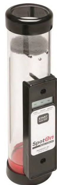
Figure 4. Electronic calibrator used to measure the flow rate from a nozzle tip.