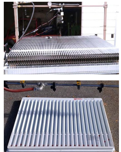
Figure 6. Examples of laboratory/shop and portable patterator tables, used to measure spray pattern distribution of individual or multiple nozzles.

The spray pattern from each nozzle tip is important to achieve nozzle-to-nozzle uniformity and avoid streaking in the field. The only way to precisely evaluate spray pattern is to use a tool called a patterator (examples shown in Figure 6) that divides and measures the spray distribution across the width of the nozzle spray pattern. Utilizing these to evaluate every nozzle tip on large booms would obviously be very impractical. Alternatively, many spray pattern problems can be identified with a careful visual inspection of the nozzle discharge. Most