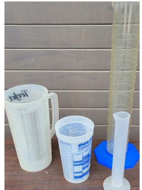
Figure 3. Examples of different graduated containers that can be used to measure the flow rate from nozzles.

A quicker way to measure actual flow rate is to use a dedicated nozzle calibrator, like the one shown in Figure 4. These