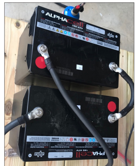
Figure 4. Lead-acid batteries connected in series.

much sunlight they receive. However, that power only needs to enter the system if there is an energy demand causing the batteries to be discharged. A charge controller regulates how power flows between the panels and the batteries. Overcharging can permanently damage batteries. Also, the charge controller ensures power from the batteries does not backfeed to the panels when there is not a solar load creating power in the panels. For multiple panels connected in