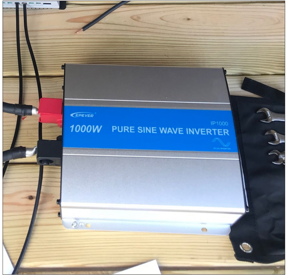
Figure 6. An inverter to change the DC power from the batteries to AC power, which can be used for tools and appliances that would typically plug into a wall outlet.

All the components in an off-grid solar system need to be connected for power to move between them. Wire is used to create these connections (Figure 7). It is important to size the wire correctly. Undersized wire will create voltage drop that will make the system less effective and may even create fire risk.