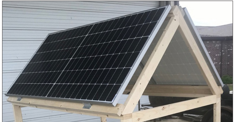
Figure 1. Solar panels mounted for demonstration.

Off-grid solar systems are often considered on farms and small acreages in locations where power is difficult or expensive to run. These locations typically do not have huge power requirements; the landowners may want to light a barn, power a fence charger, or run a small motor or power tool nearby, for example. Off-grid solar systems can provide power without the expense of an electric service. Before purchasing an off-grid solar system, it is important to know what electrical devices the system will be used to operate and to understand the components that make up the solar panel system, including batteries, fuses, controllers, and inverters.