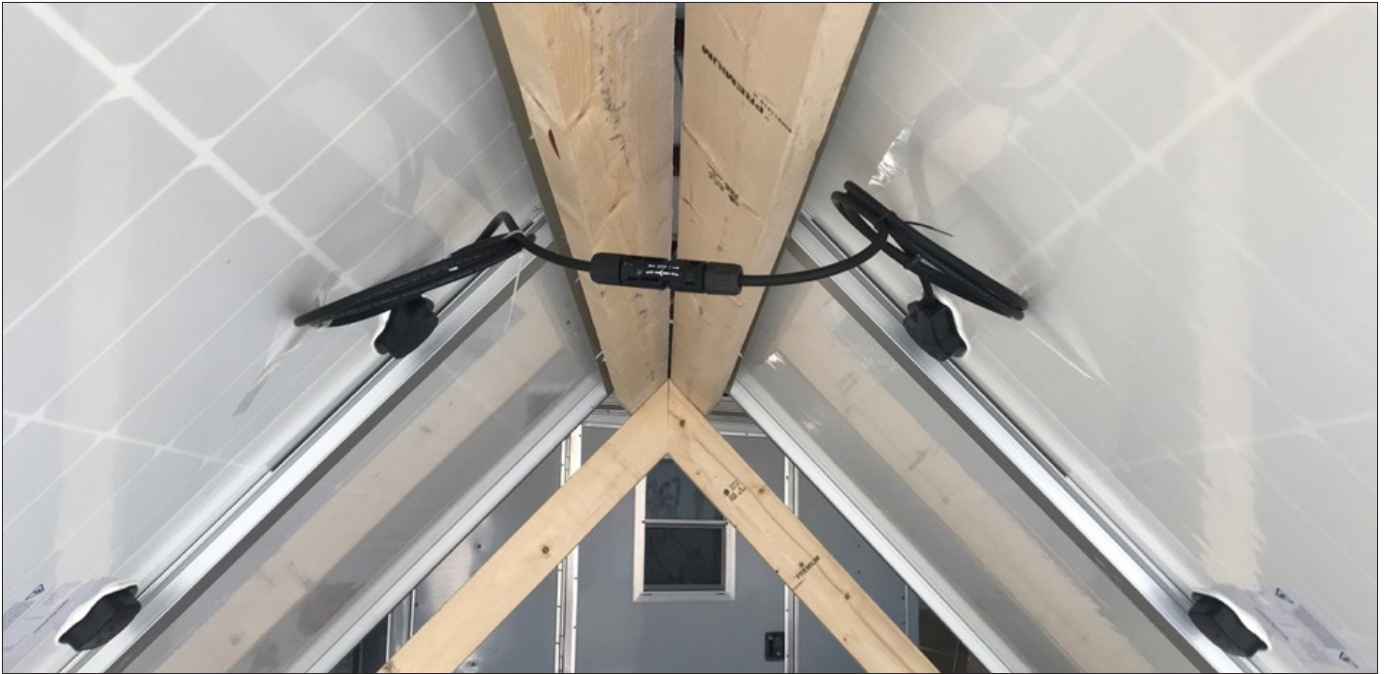
Figure 3. Two solar panels connected in series to ensure the correct output power, voltage, and amperage to match the charge controller and battery requirement.

A parallel arrangement is created by connecting the positive terminal of one panel to the positive terminal of another panel, as well as connecting the negative terminals of the two panels. When a parallel circuit is used, the current can travel multiple ways. When one panel in a parallel circuit is defective, the current will ignore the broken panel, and the other panel will still supply some power. When panels are connected in parallel, the amperage increases, but the voltage stays the same. For example, to create a 500-watt off-grid solar system that operates on 12 volts by using 250-watt panels with 12-volt outputs, two (or more) panels could be connected in parallel.