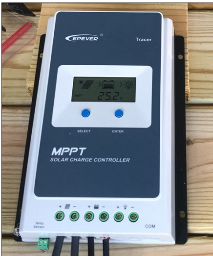
Figure 5. Charge controller for an off-grid solar system. “MPPT” indicates it is for a system with one circuit for the solar panel(s). The charge controller has wiring connections on the bottom of the unit; on the left are two connection points for the circuit with the panels, and two wires for the circuit to the batteries are connected in the center of the unit. The final two ports for wires on the right (not used in the picture) would power a small DC circuit.