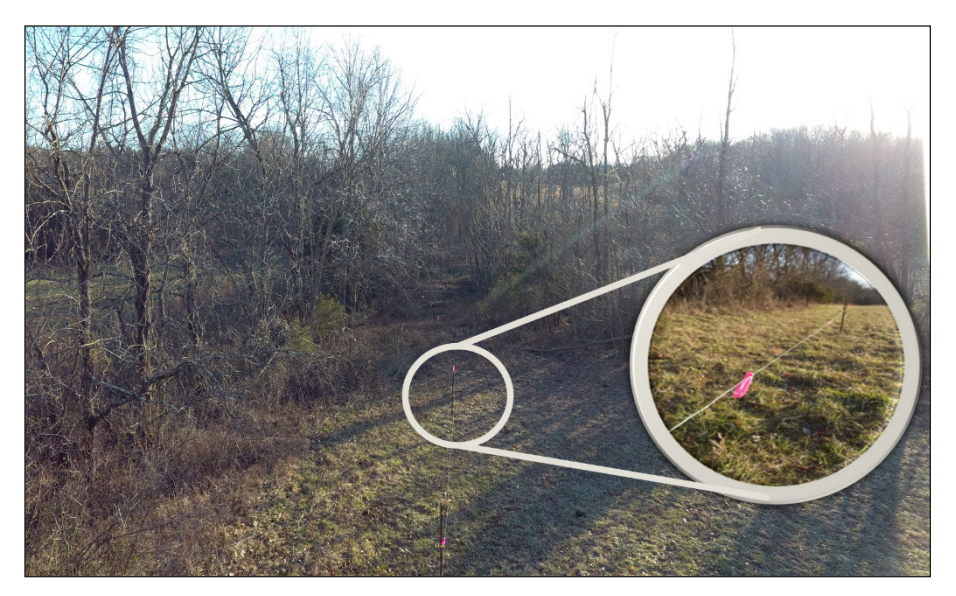
Figure 6. The view from UAS flown above a single strand of wire with ribbons. The inset provides the view from the ground.

With the current regulations, UAS operations can typically only take place during daylight hours. In the U.S., this includes 30 minutes prior to official sunrise and 30 minutes after sunset. Flying during sunrise or sunset can cause lens flares to appear in the images or video being collected. Lens flares can limit the ability to discern characteristics of the fence line being evaluated. If possible, orient the drone so that the sun is behind the camera. Different flight parameters may have to be set up for early morning and late evening flights.