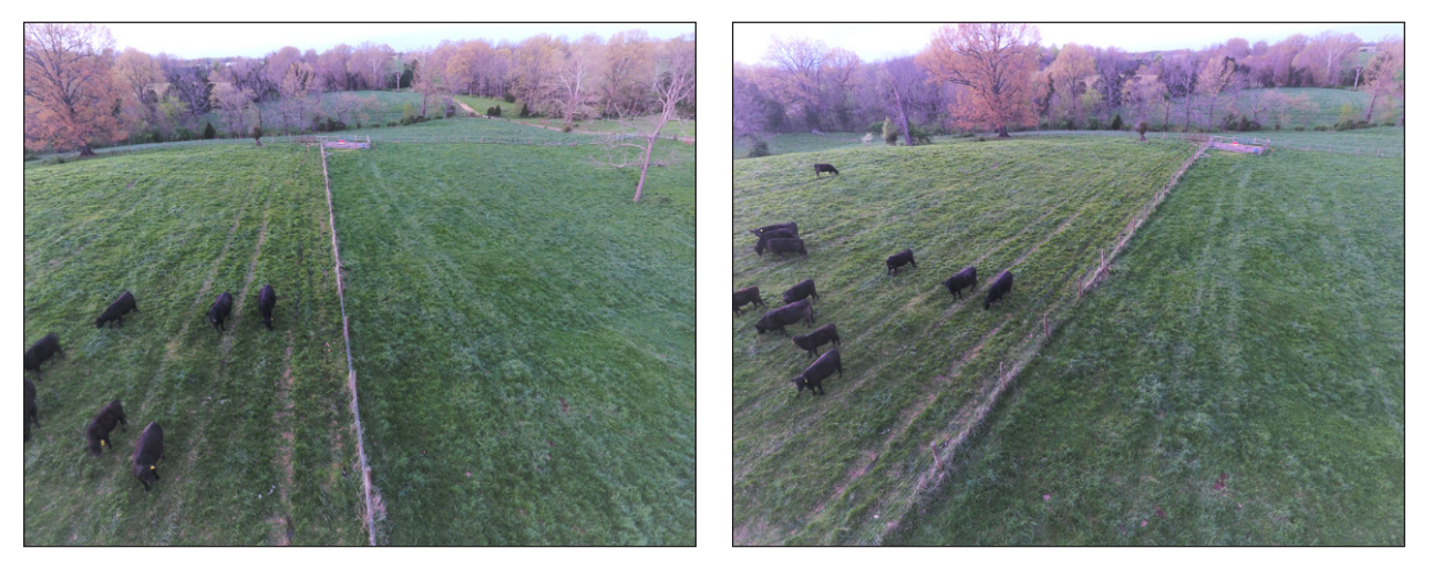
Figure 5. The view from UAS flown directly above fence line (left). The view from the UAS being flown to the side of the same fence (right).

For high tensile and woven wire fence lines with limited trees, flying directly over the fence when performing the evaluation may limit visibility. In each case, flying on either side may allow the remote pilot in command to discern fence features more easily (Figure 5).