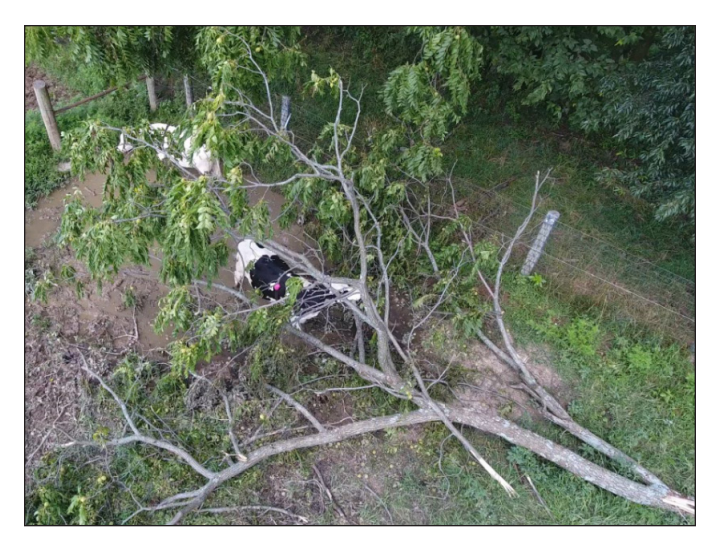
Figure 8. UAS view of downed tree limb on fence after high wind event.

The flight path (Figure 4) for evaluating the single strand electric fence line with ribbons (Figure 6) was monitored in January and February of 2020 with a DJI Phantom 4 V2. The flight route was recorded and subsequently flown using various apps. The 1,200 feet of fence line observed by the UAS was flown in approximately 1 to 3 minutes (depending upon the flight speed) (Figure 10). The average time to walk the fence line was approximately 5 minutes. While the UAS does save time in covering the distance of the fence line, time is required for preflight/postflight preparations and analysis of video. Thus, the UAS provided no time savings for evaluating the 1,200-foot section of fence. However, the potential to save time during the evaluation of longer fence lines or multiple fence lines is there, as preflight/postflight preparations would already be considered. Time savings should be greater for longer distances of fence. From a time standpoint, approximately 7,300 feet of fence line is required for the UAS to break even with manual inspection (walking). Table 2 shows the minimum break even UAS speed of 7.5 mph required to cover the 7,300 feet and account for the preflight/postflight preparations and analysis of video. The expedited monitoring of multiple fence lines should free up time to perform other pertinent tasks on the farm.