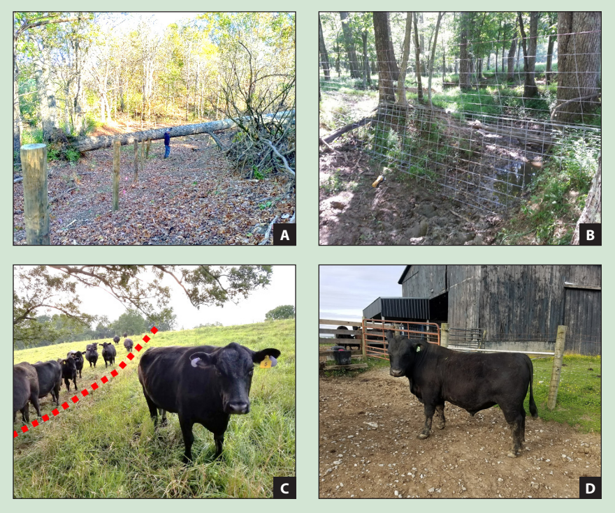
Figure 7. Fallen tree on planned fence line (a). Water gap (b). Cow on wrong side of single strand electric fence (c). Bull adjacent to fence (d).