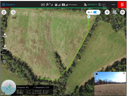
Figure 10. Flight route for the 1,200foot section of fence line.