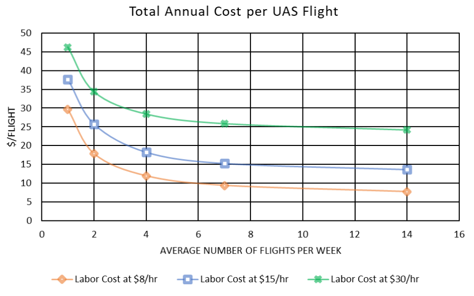
Figure 2. Total annual cost per UAS flight with three different labor costs considered as wages would most likely vary between producers. The cost per flight decreases with the increasing number of flights as the input costs are spread out over more flights.

Preprogrammed flight control, or automated control, can be performed by designing UAS GPS-waypoint designated navigation patterns within commercially available apps for the UAS to follow. From a UAS control standpoint, waypoints are comprised of a set of latitude and longitude along with elevation and other UAS parameters (speed, camera pitch, camera orientation, etc.).