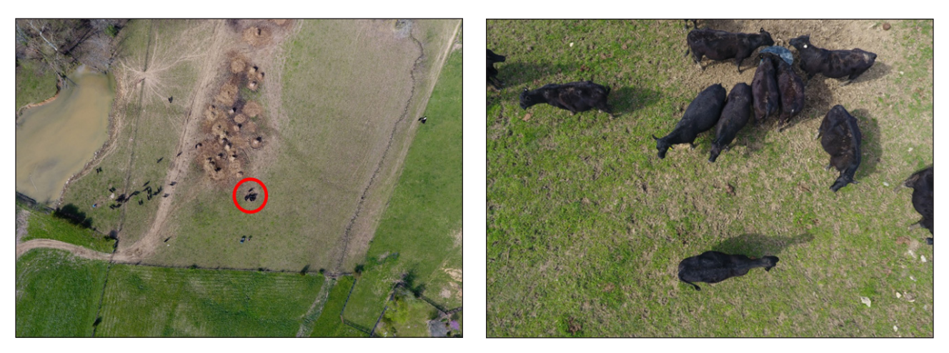
Figure 1. Left: the UAS view at 400 ft AGL; the red circle identifies the cows at a mineral feeder. Right: the UAS at 50 ft AGL shows the cows at the same mineral feeder.