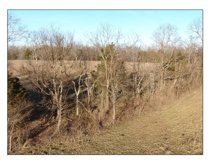
Figure 9. Neglected fence line where a UAS can be used to determine when trees have fallen.