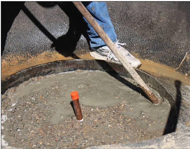
Figure 14. Use concrete to fill the inner rim of the tire tank. It is important that the concrete is tamped under the bead of the tire to prevent leaks. After tamping, level the concrete in the tank to ensure that water is distributed evenly.

To automatically control the water level in the tire tank, use a float valve assembly. Simple, pre-assembled systems are available and can be screwed onto the inflow pipe, provided the end is threaded. It will be necessary to fill the tire tank and adjust the length of the float's chain to ensure that the proper water level is maintained. If a system is not properly adjusted, it can constantly overflow, causing excess runoff and increasing water costs.