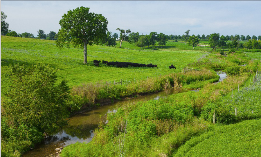
Figure 3. Fenced off riparian buffer along a central Kentucky stream.