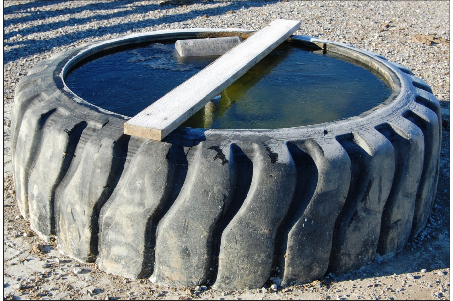
Figure 16. A cross-member consisting of a 2-inch by 8-inch board screwed to the top of the tire tank can prevent livestock from climbing into the tire tank.