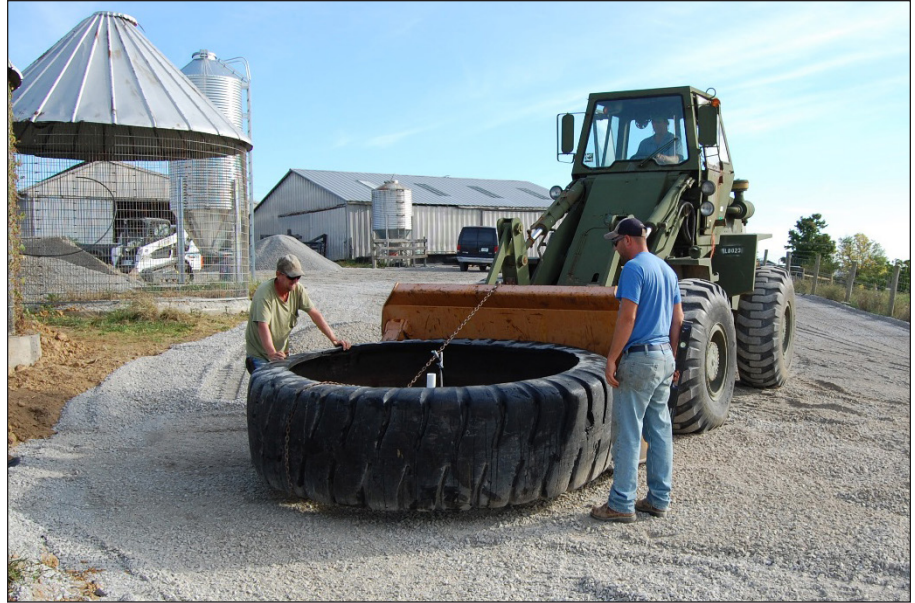
Figure 13. Movement and placement of large tires requires the use of a tractor with a front-end loader or similar and a chain.

A concrete pad or other all-weather surface should be installed around the tank to prevent mud and erosion from developing. See AEN-115: All-Weather Surfaces for Livestock for additional details on this topic. If a concrete pad is installed around the tire-tank waterer, it is recommended that the surface be grooved or textured to improve livestock footing (figures 5 and 12). Creating a concrete or gravel pad around the tire that is wide enough to support the entire length of a mature cow is desirable, and will aid in preventing a surface depression from