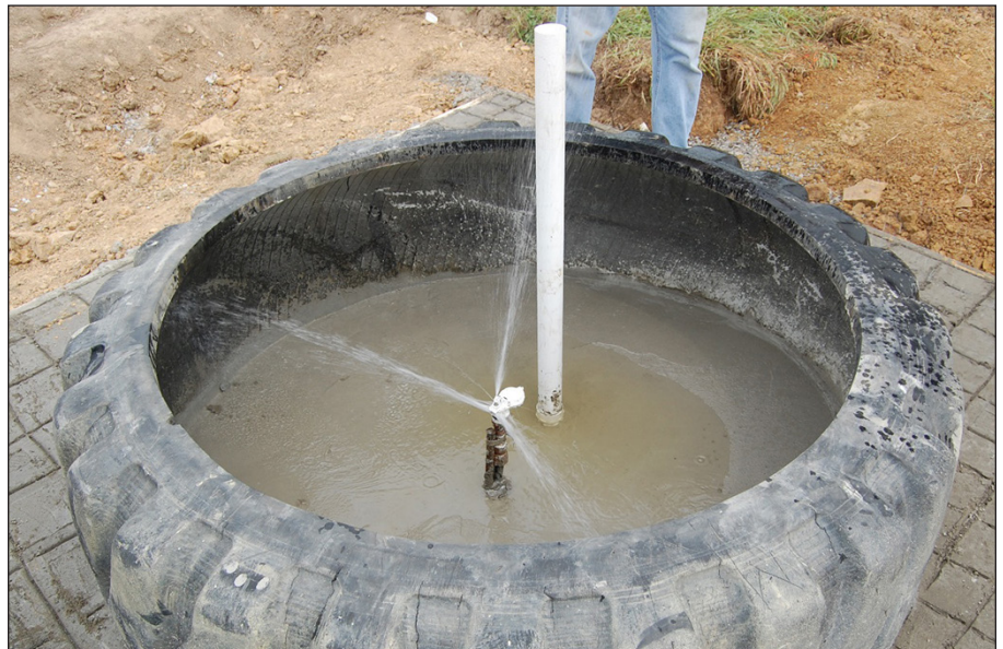
Figure 12. A standpipe is threaded to the stub out. Not shown in this photo, the standpipe should be cut 2-4 inches below the top of the tire tank to serve as an overflow.

For the drain assembly, stub out a drain line with a female threaded coupler. The drain line will be set at the level of concrete to be poured in the center of the tire (Figure 11). A stand pipe of the same diameter, with a male threaded coupler attached, should be cut to the appropriate height for an overflow (e.g., 2-4 inches below the top of the tire tank) (Figure 12). This pipe can be threaded in place to serve as an overflow during normal use and unthreaded to drain the tire for cleaning, maintenance, or discontinuation of use. The outlet of the drain line