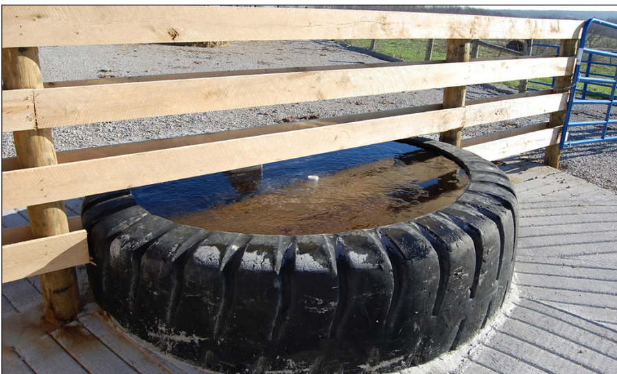
Figure 5. A tire-tank waterer installed at Eden Shale Farm in Northern Kentucky. The tire-tank waterer is used to supply drinking water to cattle in two separate fields.