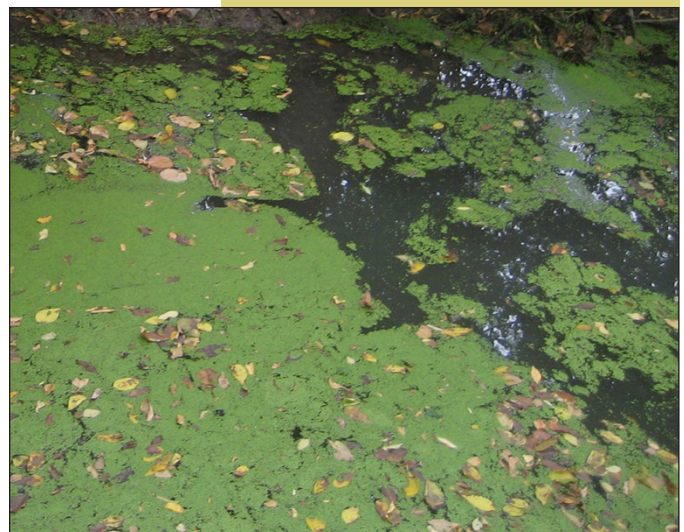
Figure 2. High levels of nutrients, such as nitrogen and phosphorus, promote algal growth, leading to algal blooms.