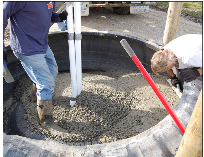
Figure 15. Use concrete to fill the bottom sidewalls of the tire tank as well as the inner rim. Be sure to tamp the concrete under the bead of the tire. Level the concrete in the tank after tamping.