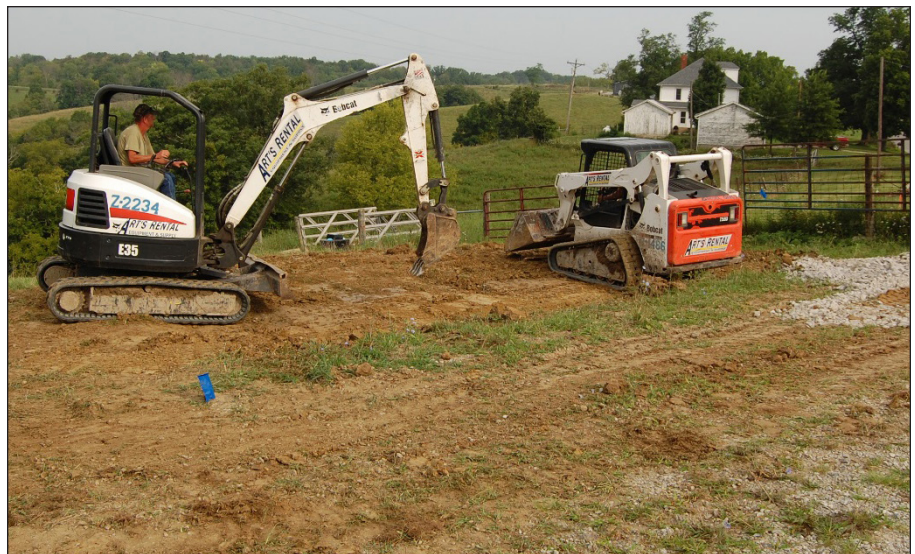
Figure 9. Remove all vegetation, manure, and mud to create a stable foundation for the tire tank.