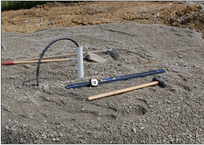
Figure 10. Water lines are placed in the proposed center of the tire tank. Use extra line length until the final water height is finalized.