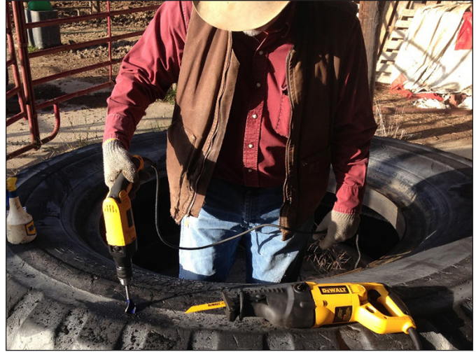
Figure 7. Drill a pilot hole in the sidewall to provide a starting point of cutting the tire with a reciprocating saw. Use a reciprocating saw with a fine-toothed blade (e.g., ten or more teeth per inch) to cut out the sidewall.

Install the heavy equipment tire tank on level ground that is free of vegetation, mud, manure, and other such unsuitable foundation materials (Figure 9). The selected site should allow surface water to readily drain away from the tire tank. Depending on the width of the tire and the size of the livestock, recessing the tire into the ground may be required to achieve the desired height. Consider installing a heavy traffic pad (AEN-115: All-Weather Surfaces for Livestock) as well to prevent the formation of mud around the water source (Figure 5). The heavy traffic pad should be large enough to support the entire length of a mature cow. Such a wide pad surrounding the tire tank will prevent surface depressions from forming around the waterer.