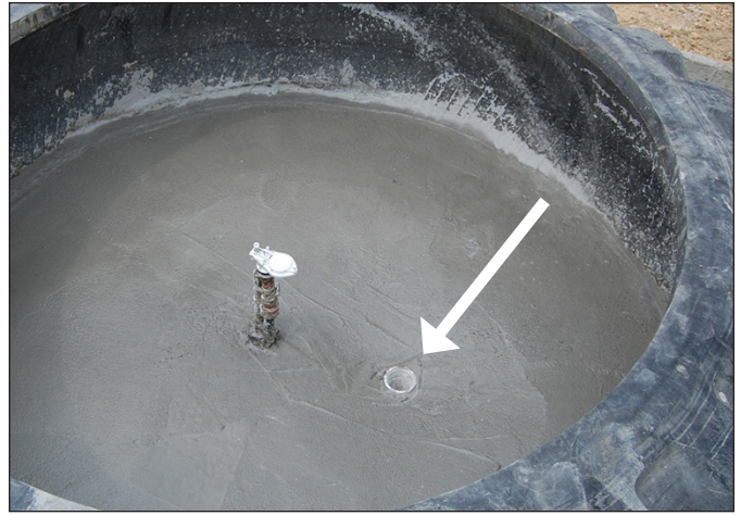
Figure 11. To create the drain assembly, stub out a female coupler (white arrow) at the level of concrete poured in the tire. The left standing pipe is the inflow or supply line.