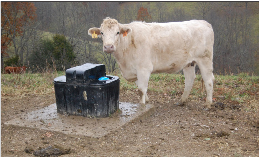
Figure 4. Automatic water fountains, which are available in a variety of sizes, are one way to provide drinking water to livestock.