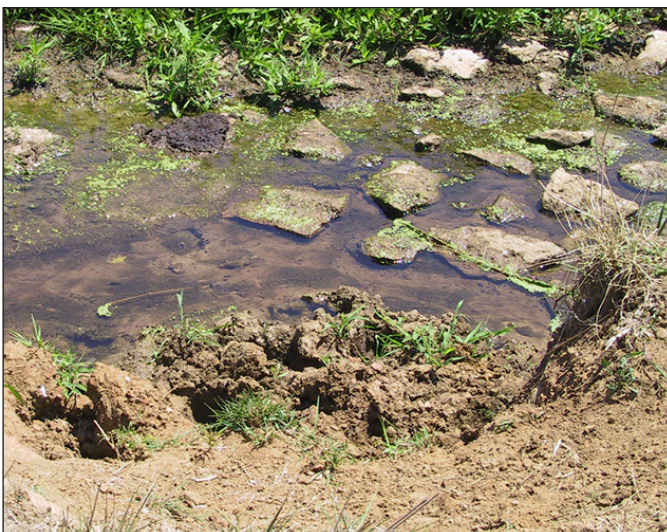
Figure 1. Livestock can degrade soil and water quality by removing streamside vegetation, trampling streambanks, and defecating and urinating in streams.

Freezing. As with an automatic water fountain, the water in tire-tank waterers can freeze. While the tire itself provides insulation, the surface of the water is exposed to air and wind.