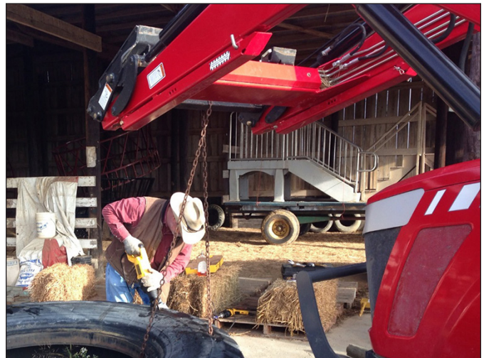
Figure 8. Support the cut portion of the sidewall, such as with the front-end loader and chain, to keep the saw from binding.