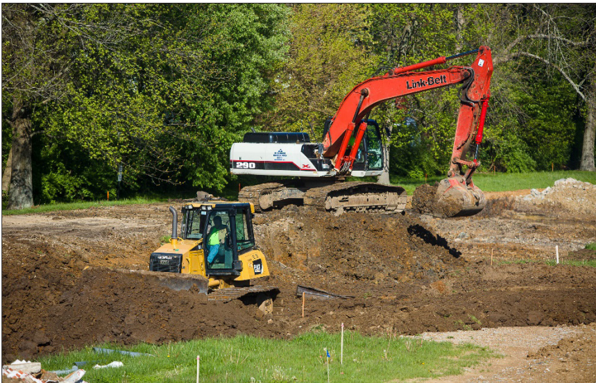
Figure 1. Sources of sediment in watersheds include (a) construction sites and (b) stream beds and banks.

S ediment is one of the most common pollutants in waterbodies such as streams, rivers and lakes. Sources of sediment include upland areas, meaning lands above the floodplain, as well as the waterbodies themselves (Figure 1). Human activities that reduce or remove vegetation increase the amount of soil eroded. In the uplands, examples of sediment sources include tilled crop fields, grazed pastures, construction sites, and timber harvesting areas. Along water bodies, the beds and banks erode due to the force of moving water. Streambank erosion, for instance, contributes anywhere from 15 to 90% of the suspended sediment load in streams.