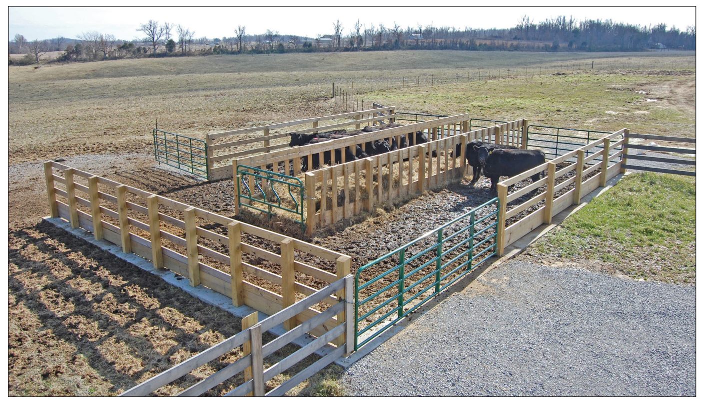
Figure 6. This picture shows two surfaces to support livestock: a concrete surface for feeding cattle and scraping and a heavy use area pad made of compacted rock and geotextile fabric.

to the surface, which could cause the fabric to degrade in sunlight or unravel when the pad is cleaned. After the site is prepared, stretch the fabric so that there are no wrinkles. Wrinkles prevent adequate distribution of loads and could compromise the pad. Pads larger than a single width of fabric (12 feet) should be laid so that they overlap by at least 2 feet. Ideally, rock should not be dropped onto the fabric from a distance greater than 3 feet to prevent damage to the fabric. Most importantly, use caution when dumping the first loads of rock to avoid ripping or wrinkling the fabric. If the fabric is wrinkled or damaged, it will not be as effective as a reinforcement material. Dense grade aggregate (DGA) should be added over the base laver of rocks to provide a solid, stable surface.