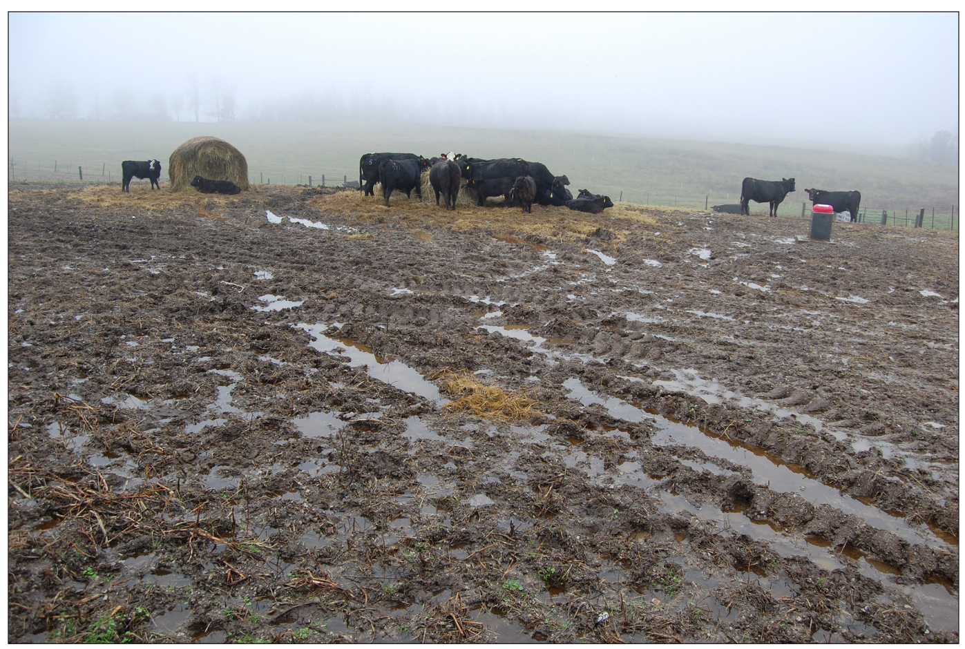
Figure 1. An unimproved surface area with tire rutting, wasted feed, and poor walking conditions for cattle.