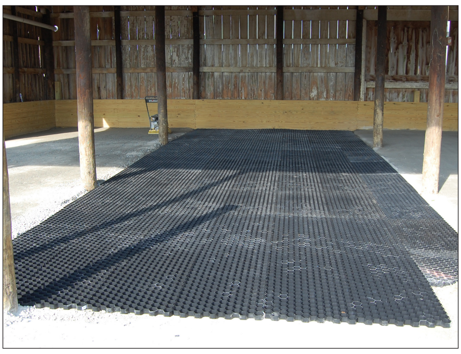
Figure 7. Gravel paver grid used to reinforce a barn floor where livestock will be confined.

There are two ways to use fly ash to harden heavy traffic areas. The first is to mix fly ash with a clay soil, then mix in water, and compact the mixture in place. This method can produce a good surface, but it is difficult to do and generally not recommended. The second method is to build a fly ash pad on top of the soil. Adding an adequate amount of water and compaction is crucial to producing a long-lasting, functioning pad in both methods.