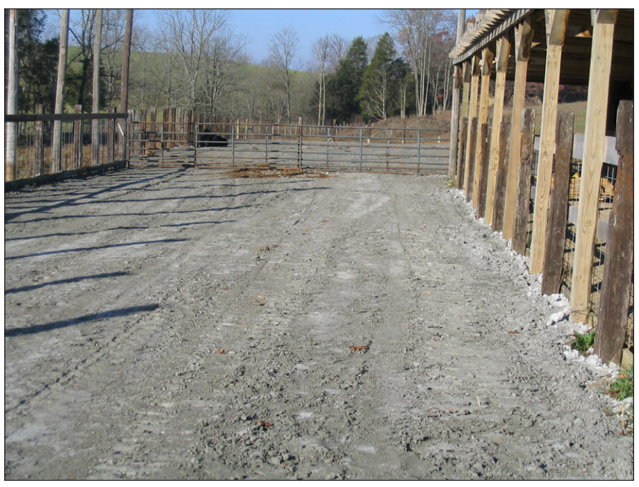
Figure 8. A cattle feeding pad constructed with coal combustion by-products.