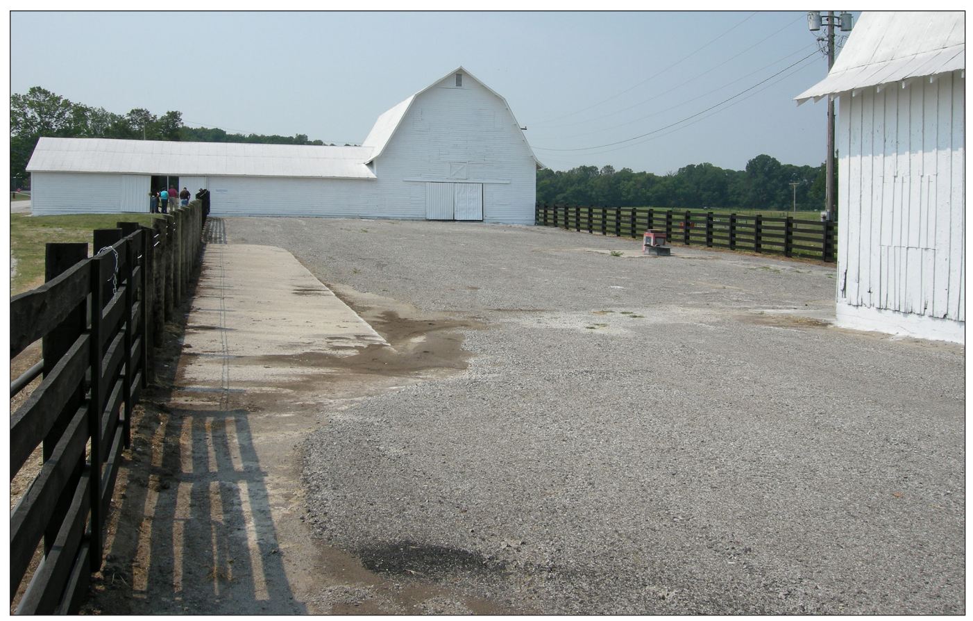
Figure 4. Example of a feeding lot using geotextile fabric and rock.

tion. Non-woven fabrics (heat bonded and needle punched) are composed of a continuous sheet of felt-like engineered material. Needle punched fabrics provide filtration, but are generally not as strong as woven fabrics.