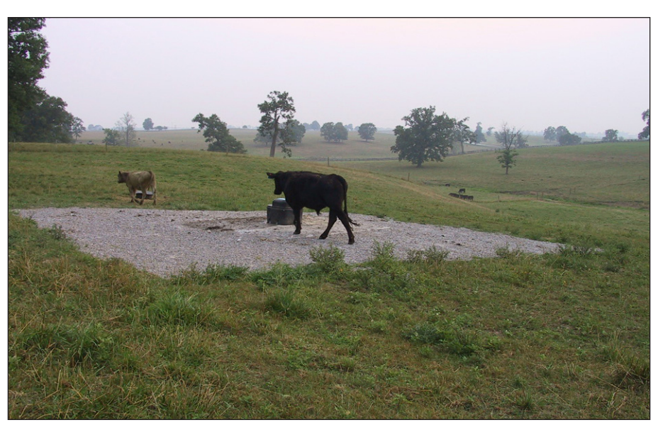
Figure 5. Adequately designed concrete pad, foundation, and heavy use area pad constructed of concrete, geotextile fabric, and rock.

A combination of materials can be used together to satisfy different needs in the same area (Figures 5 and 6). For