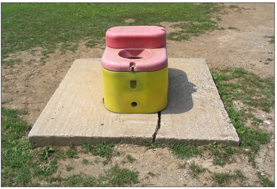
Figure 2. Poorly constructed foundation for a concrete pad.

For the construction of concrete pads, an adequate foundation must first be prepared by removing all topsoil to a level of compactable soil. For pads that are going to be subjected to heavy loads, a minimum of 6 inches of compacted dense grade aggregate (DGA) should be placed to provide base support for the concrete pad. Examples of concrete placed without an adequately prepared foundation are shown in figures 2, and 3. A preferred method for installing concrete pads, such as these, is to extend heavy use area pads beyond the concrete (Figures 4, 5, and 6). Inadequate foundation preparation can lead to concrete pad failure and/or frozen or damaged water pipes.