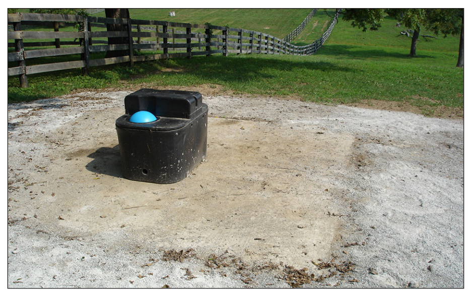
Figure 9. A soil-cement pad placed adjacent to a concrete pad for a waterer.

concrete pad with soil-cement (Figure 9). For more information about constructing a high traffic pad with soil cement, refer to University of Kentucky Cooperative Extension publication Using Soil-Cement on Horse and Livestock Farms (ID-176).